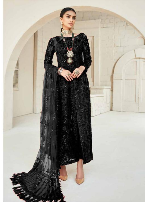
TOP - Net with heavy embroidery DUPATTA - Net whit heavy embroidery BOTTOM - heavy shantu