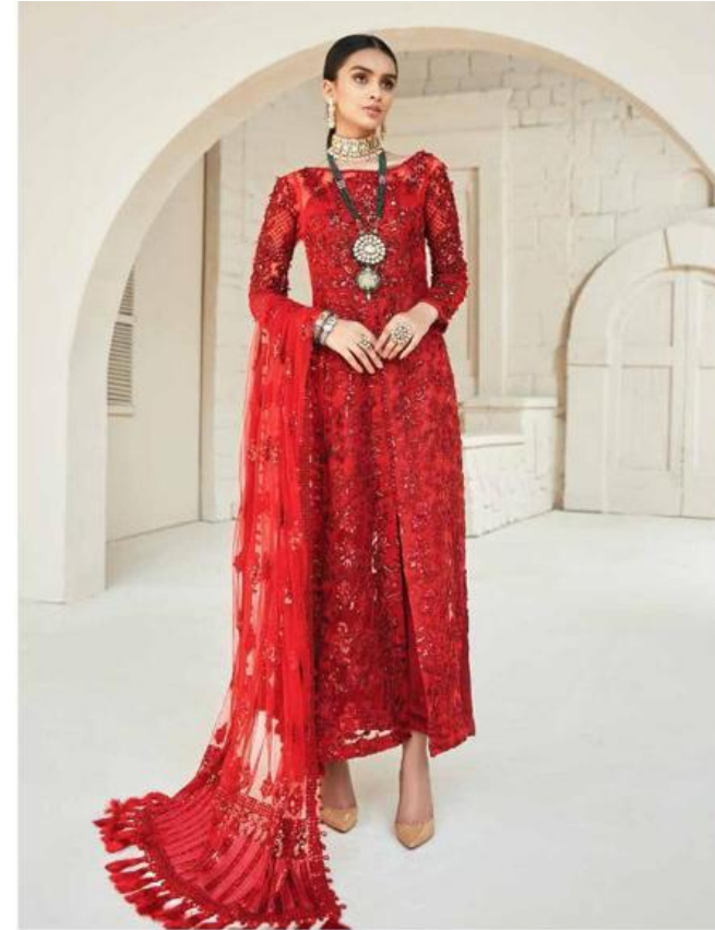
TOP - Net with heavy embroidery DUPATTA - Net whit heavy embroidery BOTTOM - heavy shantu