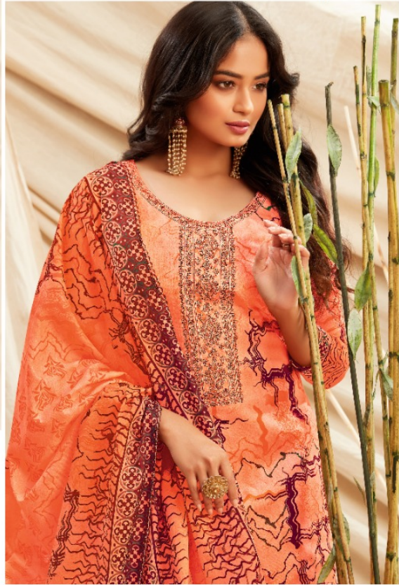
S - 544 - 009 what is the key factors between design and trends? it's a fashion connection of both are essential to give perfect fashion look to you.