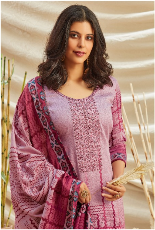
"Luxury is the ease of a t shirt in a very expensive dress." S - 544 - 004