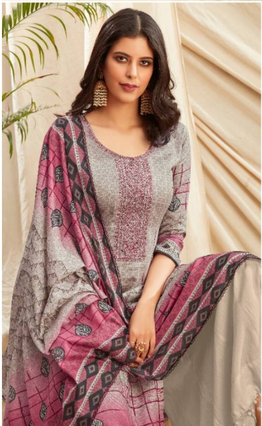
the mytic beauty of cool season shades from last past years, and company growing with almost in past years. S - 544 - 006