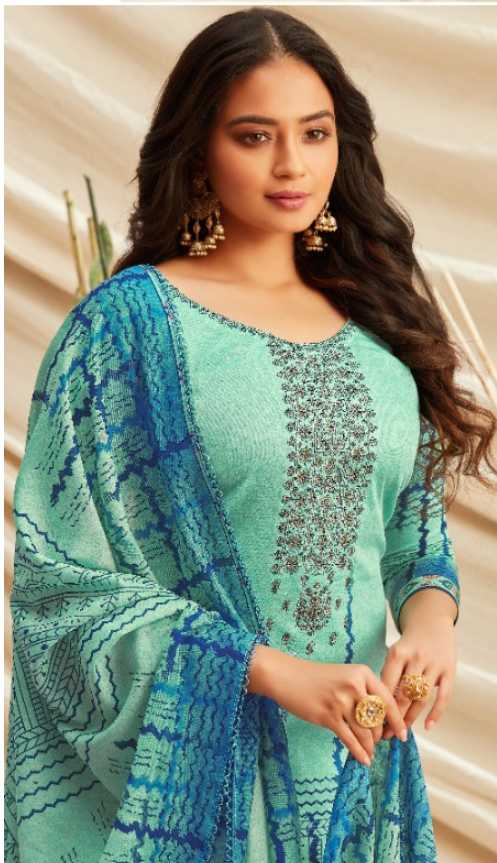
this season assortment brings your word rose too close to great looking colours and fantastic pattern