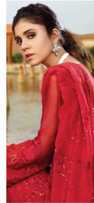
Top - Georgette heavy embroidered Inner Bottom - Santoon with bottom emb patch Dupatta - Nazneen heavy embroidered