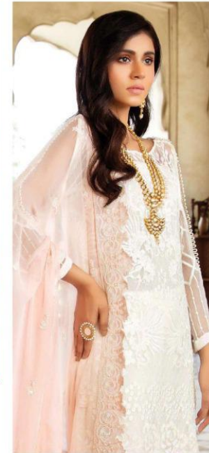
Top - Georgette heavy embroidered Inner Bottom - Santoon with bottom emb patch Dupatta - Nazneen heavy embroidered