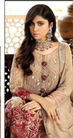
Top - Georgette heavy embroidered Inner Bottom - Santoon silk Dupatta - Nazneen heavy embroidered