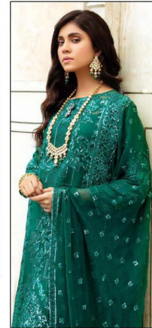
Top - Georgette heavy embroidered Inner Bottom - Santoon with bottom emb patch Dupatta - Nazneen heavy embroidered