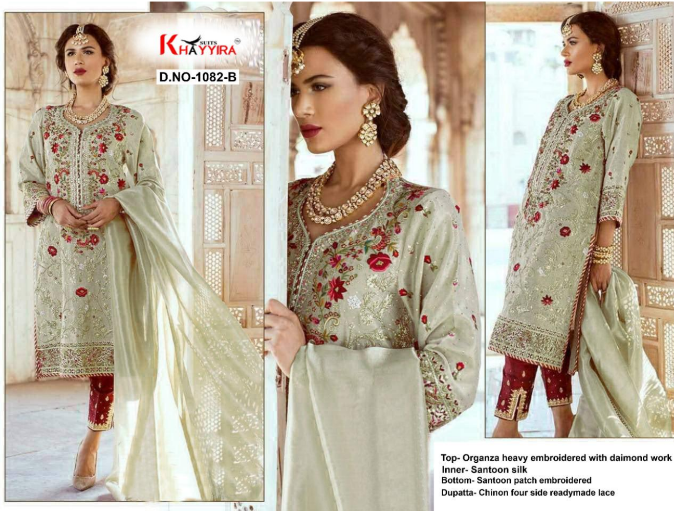
Top- Organza heavy embroidered with daimond work Inner- Santoon silk Bottom- Santoon patch embroidered Dupatta- Chinon four side readymade lace