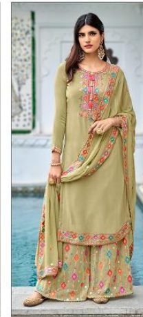
► 1319 ◀