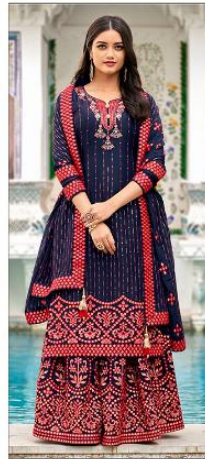
► 1316 ◀