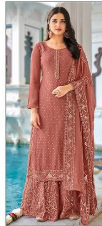
► 1317 ◀