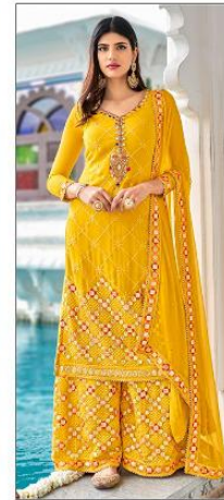
► 1318 ◀