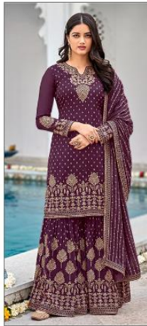
► 1314 ◀