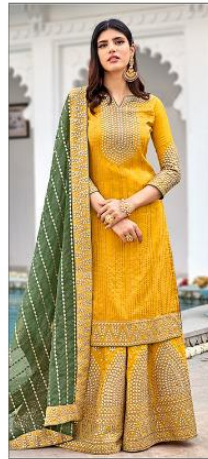
► 1315 ◀