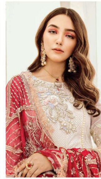
Top - Georgette heavy embroidered with neck emb patch semi stitched Inner Bottom - Santoon silk Dupatta - Nazneen heavy embroidered with four side readymade lace