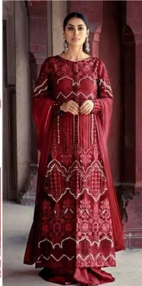
Shree fabric s.252 butterfly net salwar suit