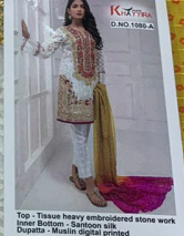
Top - Tissue heavy embroidered stone work Inner Bottom - 84% Moos silk Dupatta - Muslin (light pink)