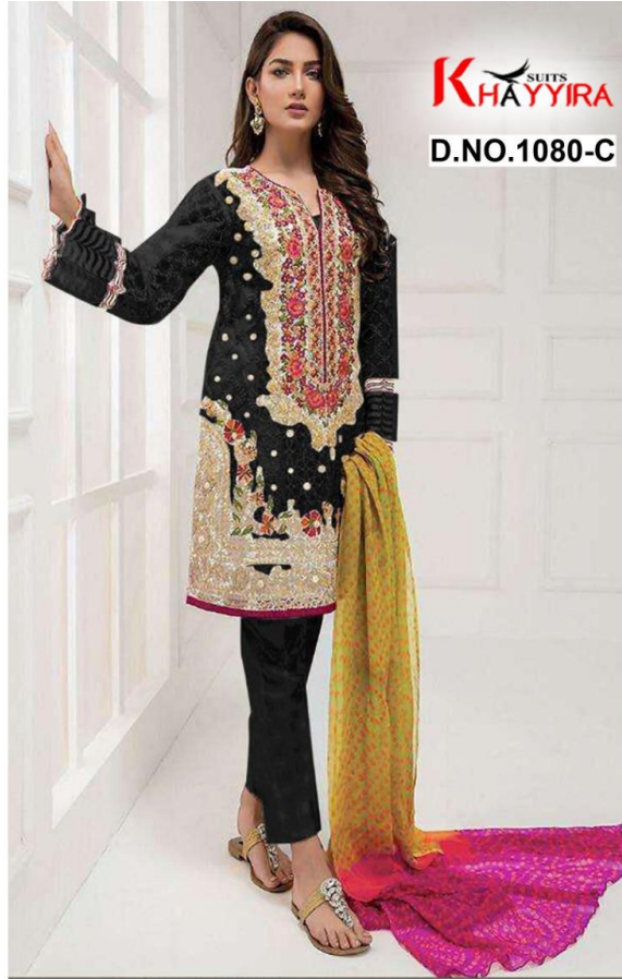
Top - Tissue heavy embroidered stone work Inner Bottom - Santoon silk Dupatta - Muslin digital printed