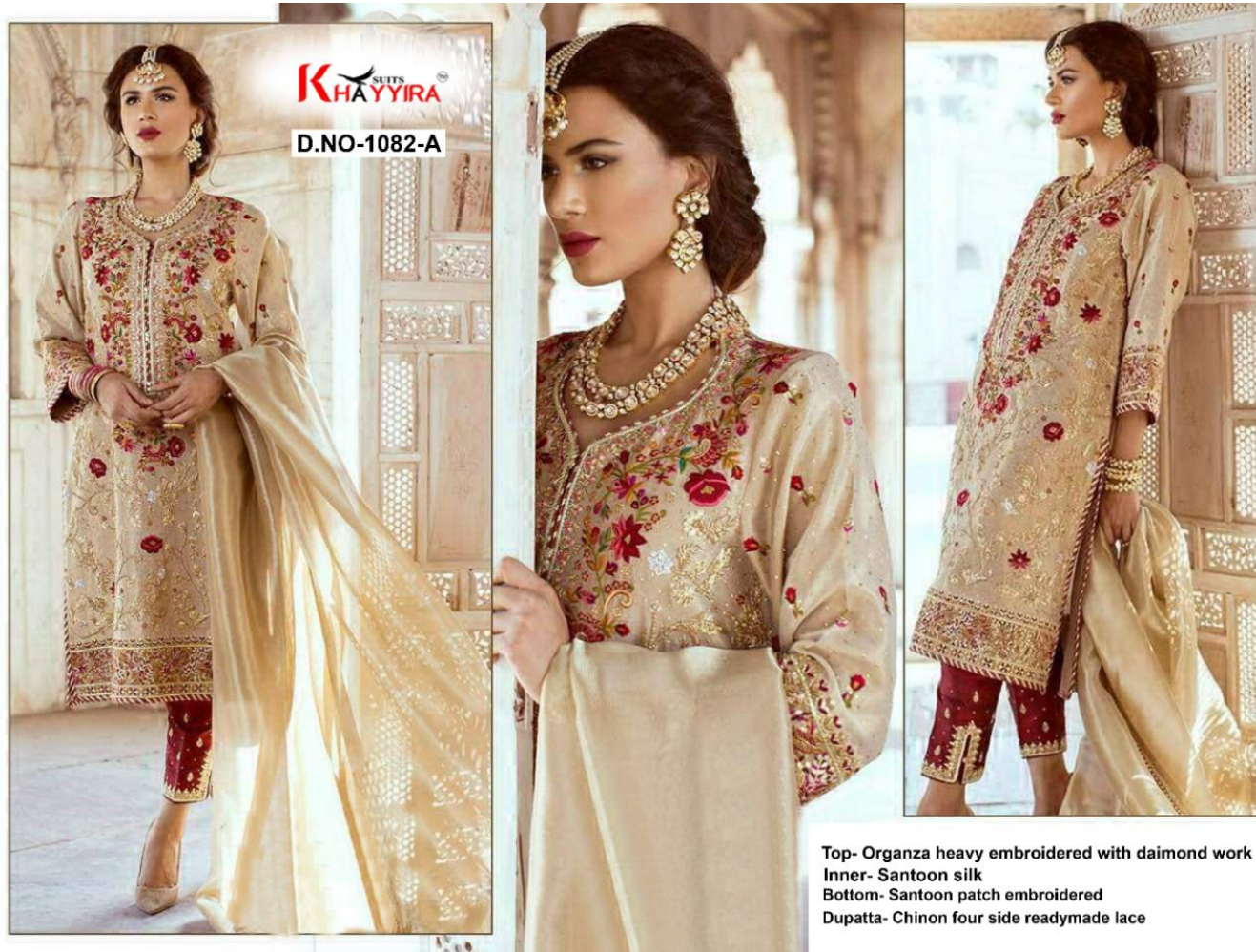
Top- Organza heavy embroidered with daimond work Inner- Santoon silk Bottom- Santoon patch embroidered Dupatta- Chinon four side readymade lace