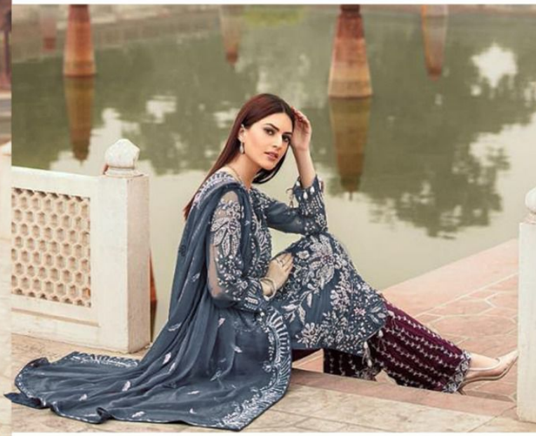
Top- Georgette heavy embroidered with daimond work Inner- Santoon silk Bottom- Santoon self embroidered Dupatta- Nazneen heavy embroidered