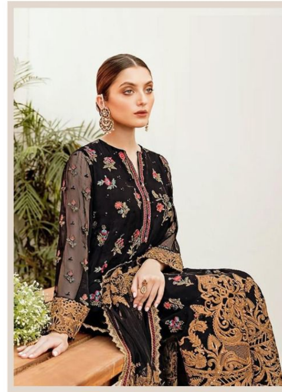
Top - Georgette heavy embroidered Inner Bottom - Santoon silk Dupatta - Butterfly net heavy embroidered