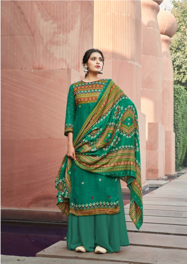
212-009 THE ETHNIC ELEMENTS OF INDIAN FASHION FROM TRADITIONAL MOTIFS TO CUSTOMARY ESSENTIAL HINTS OF FOLK AND VIBRANT REGIONAL COLOURS.