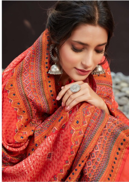
THE ETHNIC ELEMENTS OF INDIAN FASHION FROM TRADITIONAL MOTIFS TO CUSTOMARY ESSENTIAL HINTS OF FOLK AND VIBRANT REGIONAL COLOURS.