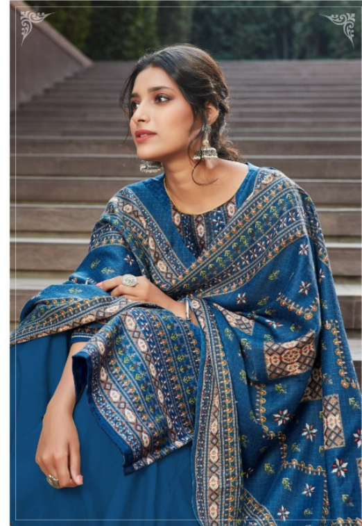
THE ETHNIC ELEMENTS OF INDIAN FASHION FROM TRADITIONAL MOTIFS TO CUSTOMARY ESSENTIAL HUES OF FOLK AND VIBRANT REGIONAL COLOURS.