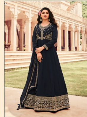
• 14828 •