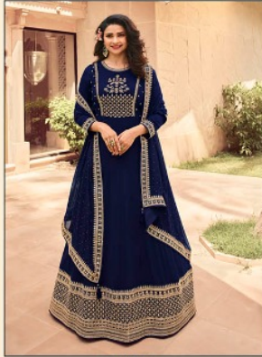
• 14821 •