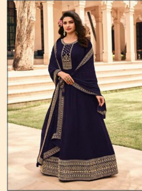
• 14826 •