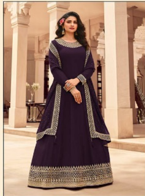
• 14824 •