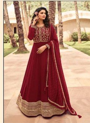
• 14827 •