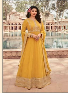
• 14825 •