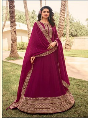
• 14822 •