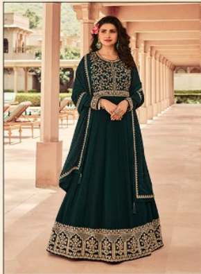
• 14823 •