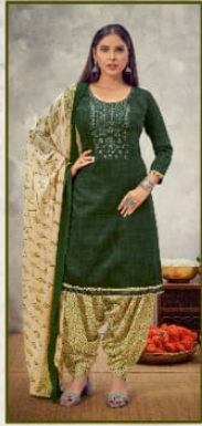
S 839 001