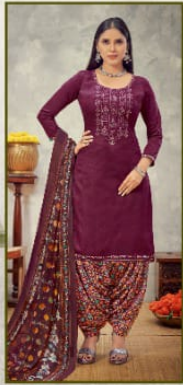
S 839 006