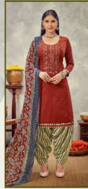
S 839 004