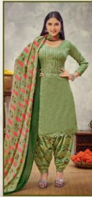
S 839 008