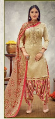
S 839 005