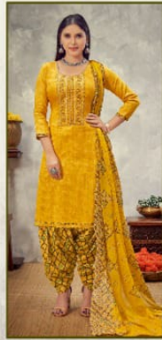
S 839 007