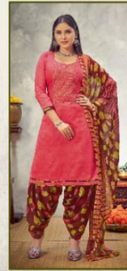
S 839 010