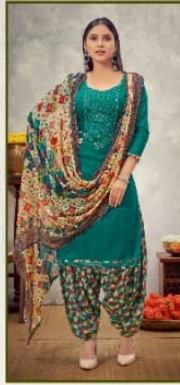
S 839 003