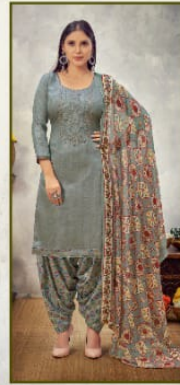
S 839 009