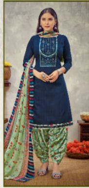
S 839 002