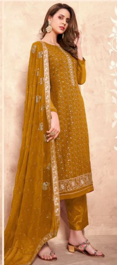
✧ 2022-C ✧