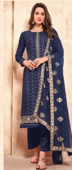
✧ 2022-D ✧