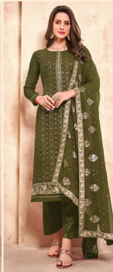
✧ 2022-B ✧