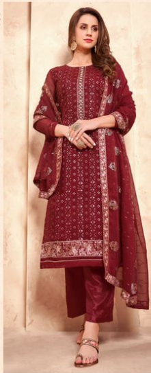
✧ 2022-A ✧