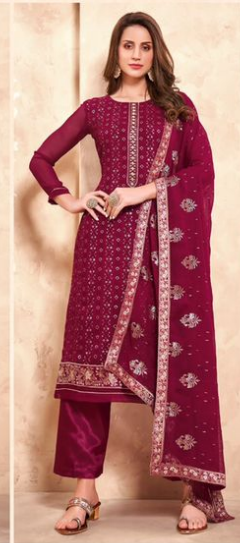
✧ 2022-E ✧