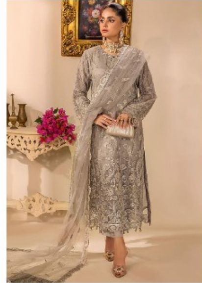
DESIGN - 02