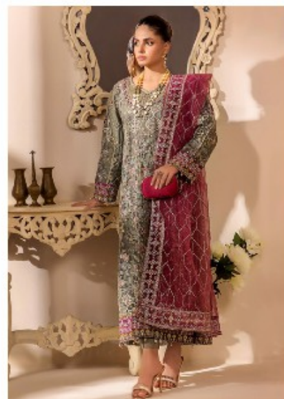
DESIGN - 04