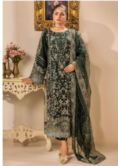
DESIGN - 01