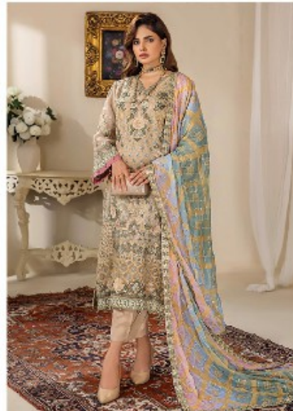
DESIGN - 03