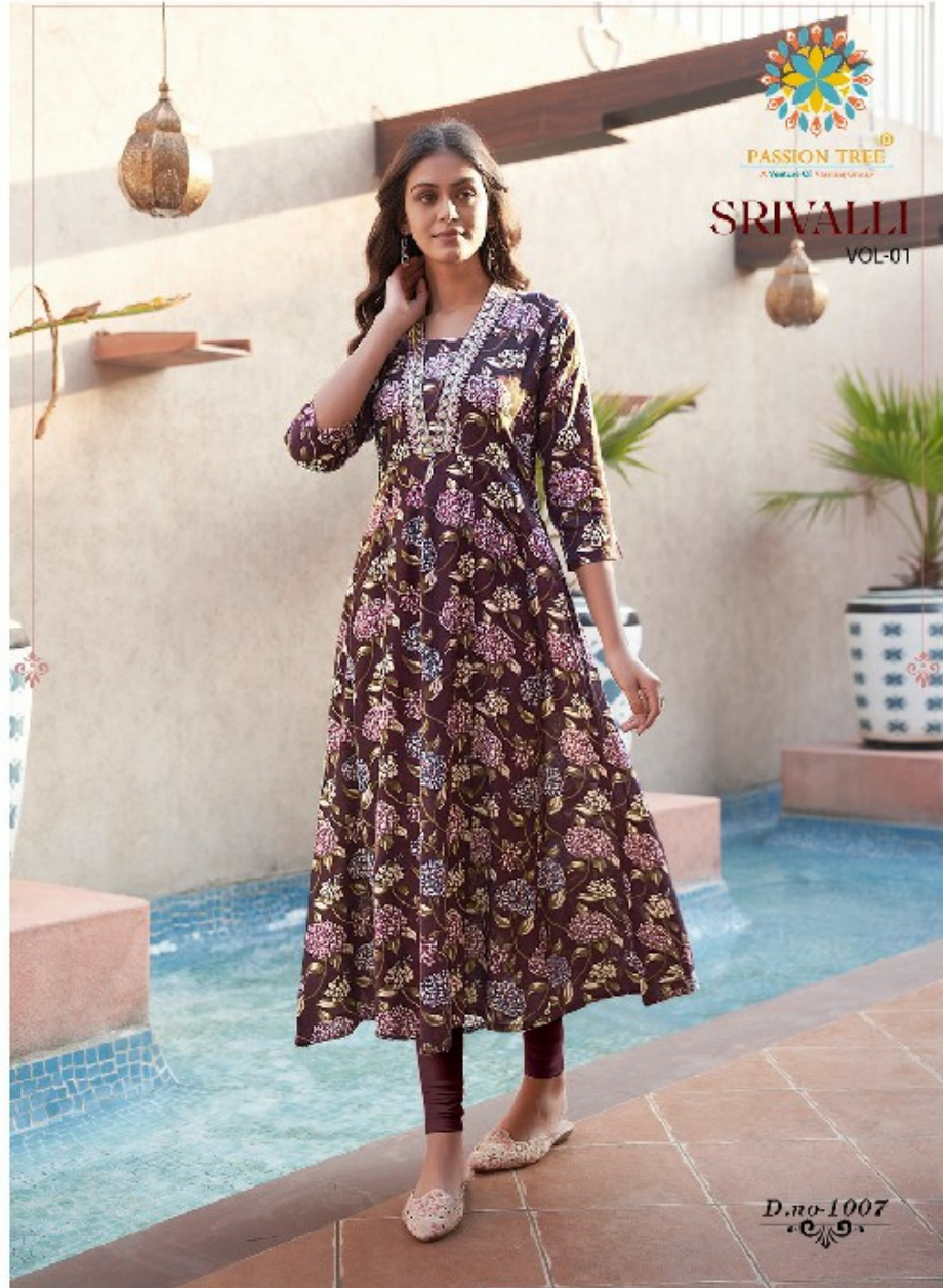
Dressed for the wedding season in style.