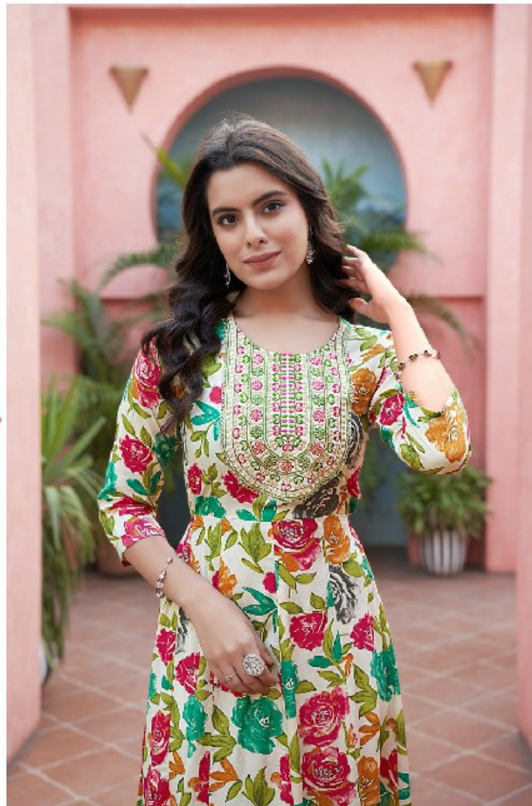
Keeping it classy with a touch of tradition