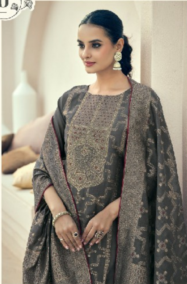
Banarasi Adha Vol-2