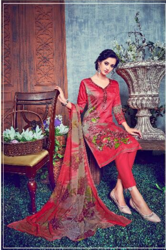
Brighten up yourself with an array of Florals in red on soft surface that will take you through the season in style.