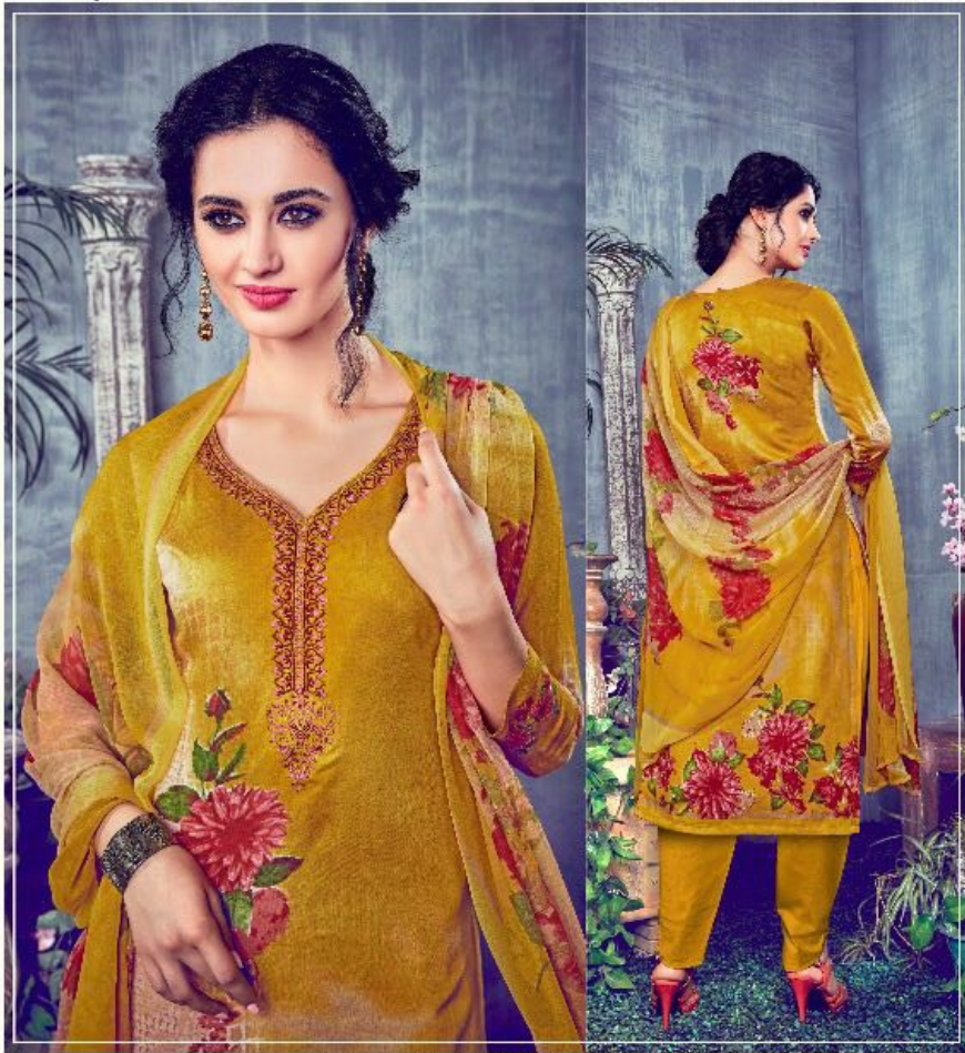
Invest in a look back with these retro shades.