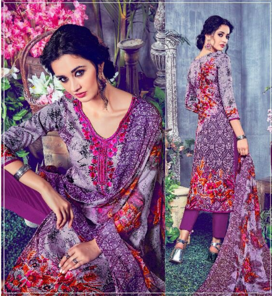
The grace and dignity which only a dress can impart. The piece of artistry of this dress tell altogether a different story.