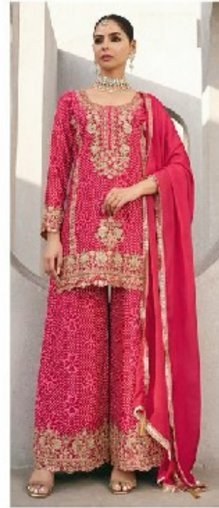
|| 727 ||