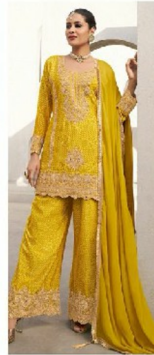
|| 728 ||