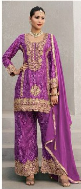
|| 725 ||