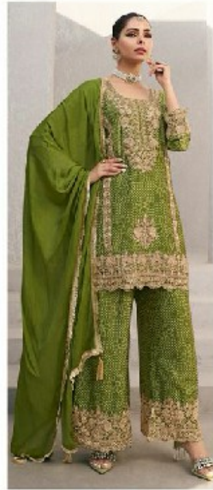
|| 726 ||