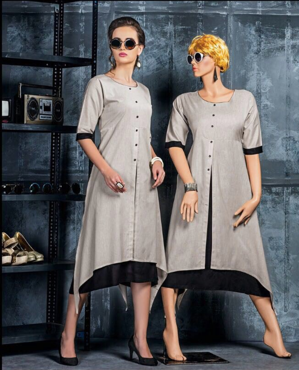
Enjoy the spectacular print on gripping colour that brings chrisma to your personality.