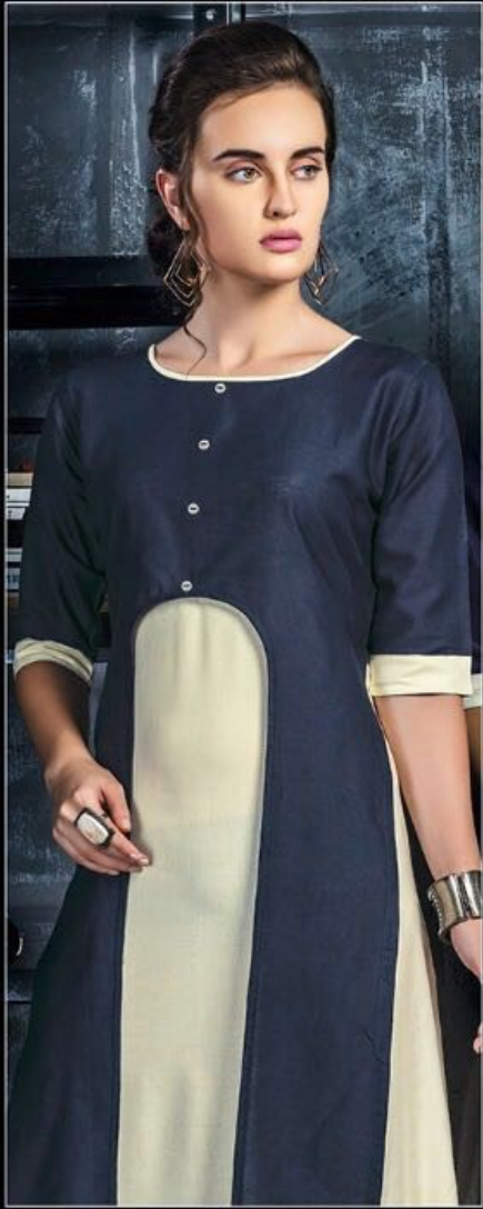
STYLES WHEN THEY'RE RUNNING YOU OUT OF TOWN AND YOU MAKE IT LOOK LIKE YOU'RE LEADING THE PARADE.