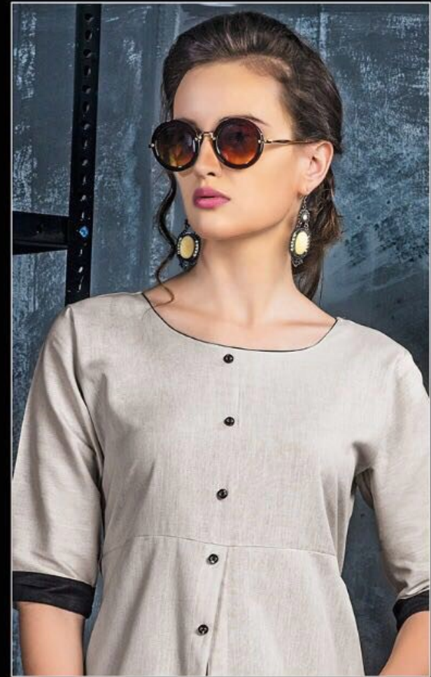
SENSIBLE COLOR, EXCELLENT DESIGNS AND ROMANTIC MOODS GIVES PERFECT COMBINATION OF SENSE AND SENSIBILITY