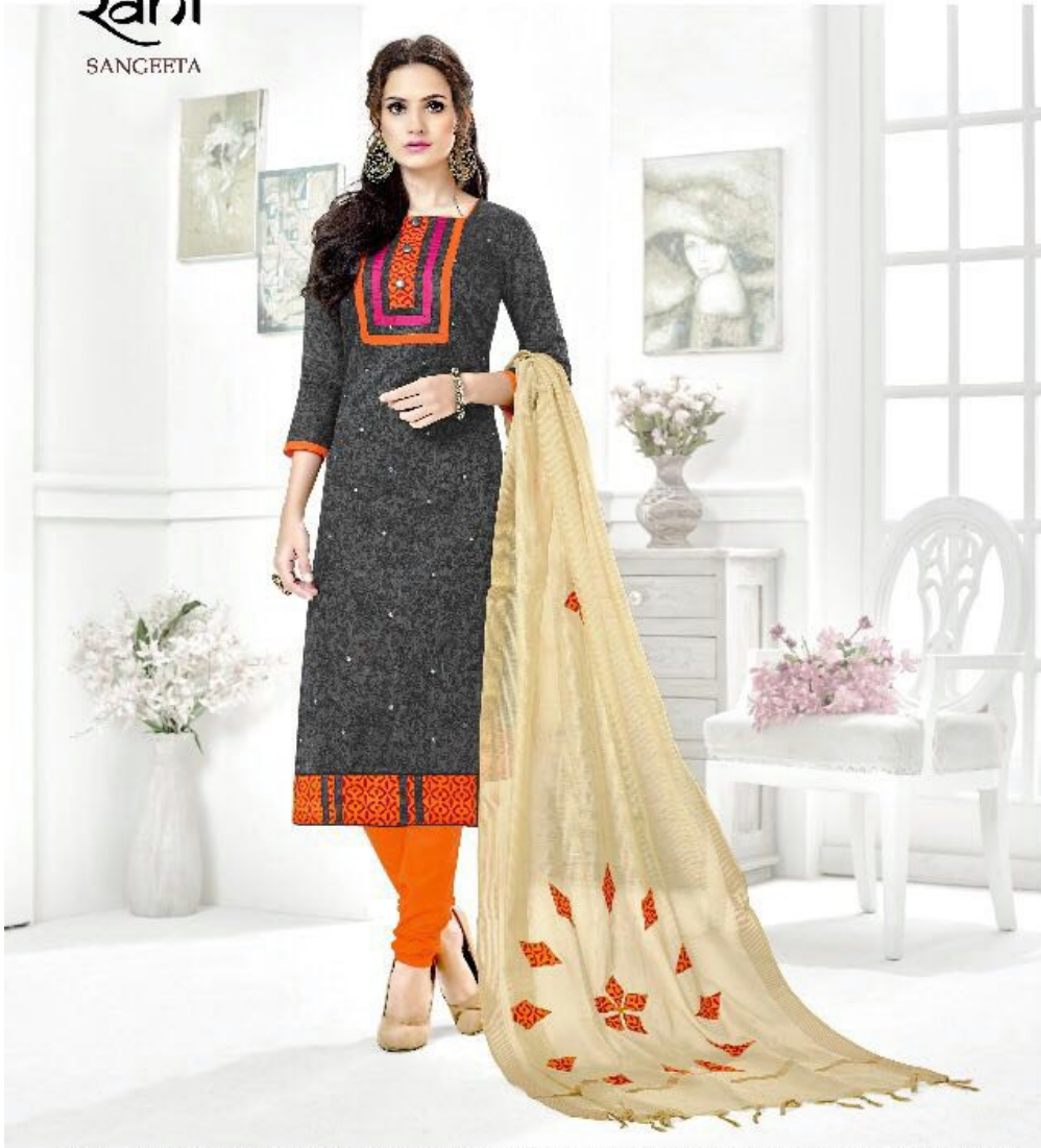
101 The enigma and charm of this is a beautiful amalgamation of style and culture, bringine out the essence of true beauty! the colours exude out the passion and glory towards royalty and highlights indian traditions along with is mysterious patterns that not only brings out simplicity, but also strikes a classy look, ensuring all heads to turn towards you!