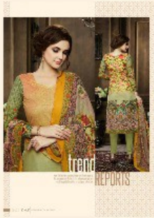
K - 01