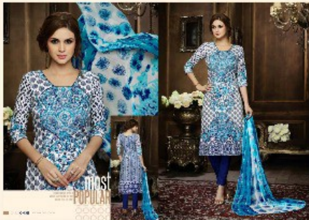
K - 09