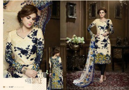
K - 07