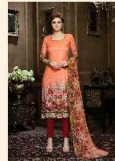
K - 10