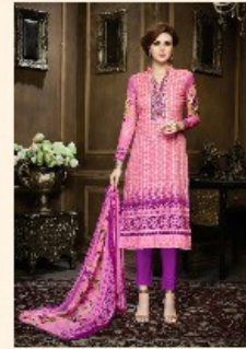
K - 04