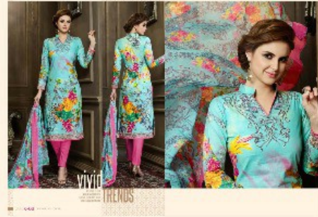
K - 03