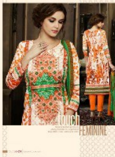
K - 05