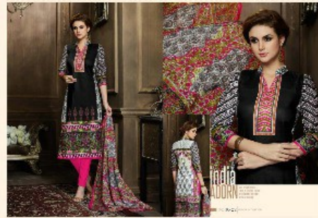
K - 02