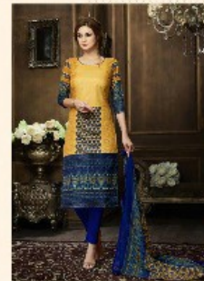
K - 08