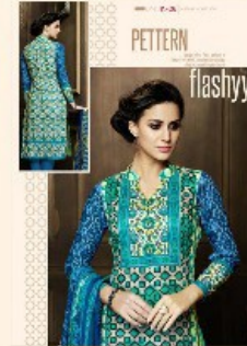
K - 06