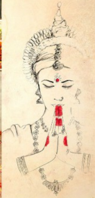
CATCH THE SEASON'S REVERENTLY FEMINE MOOD THIS COLLECTION BEAUTIFUL LIGHT COLOR SHADE WORK SAREES AND DESIGN INSPIRED BY THE BEAUTY OF NATURE.