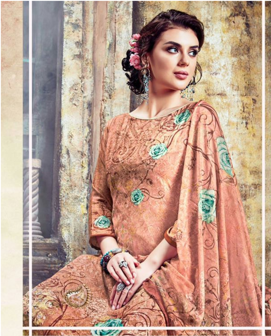
Our elegant collection and fashion Patterns. Define true quintessence In women