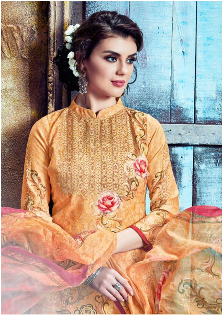
Beauty is only skin deep, ugly goes right to the bone