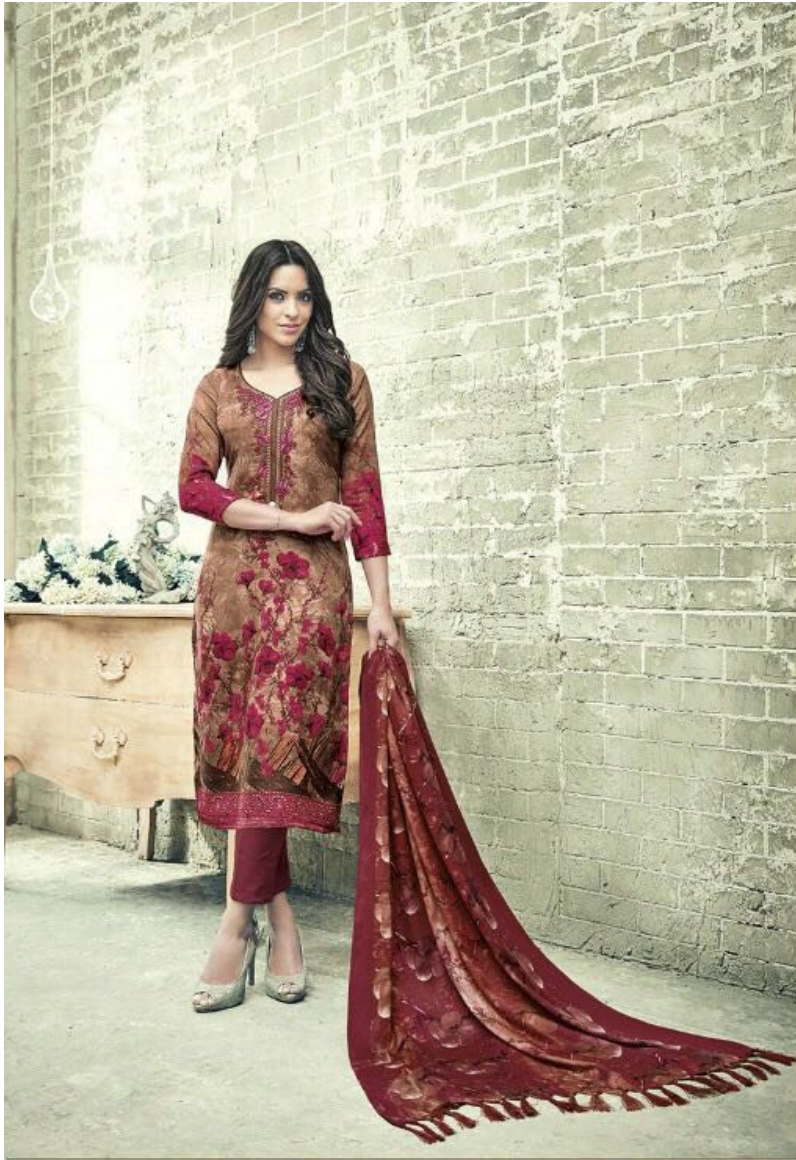
DRESS MARKS THE BEAUTY OF A DEMURE BRIDE, IT TELLS TALE OF PREJUDICE AND PRIDE!