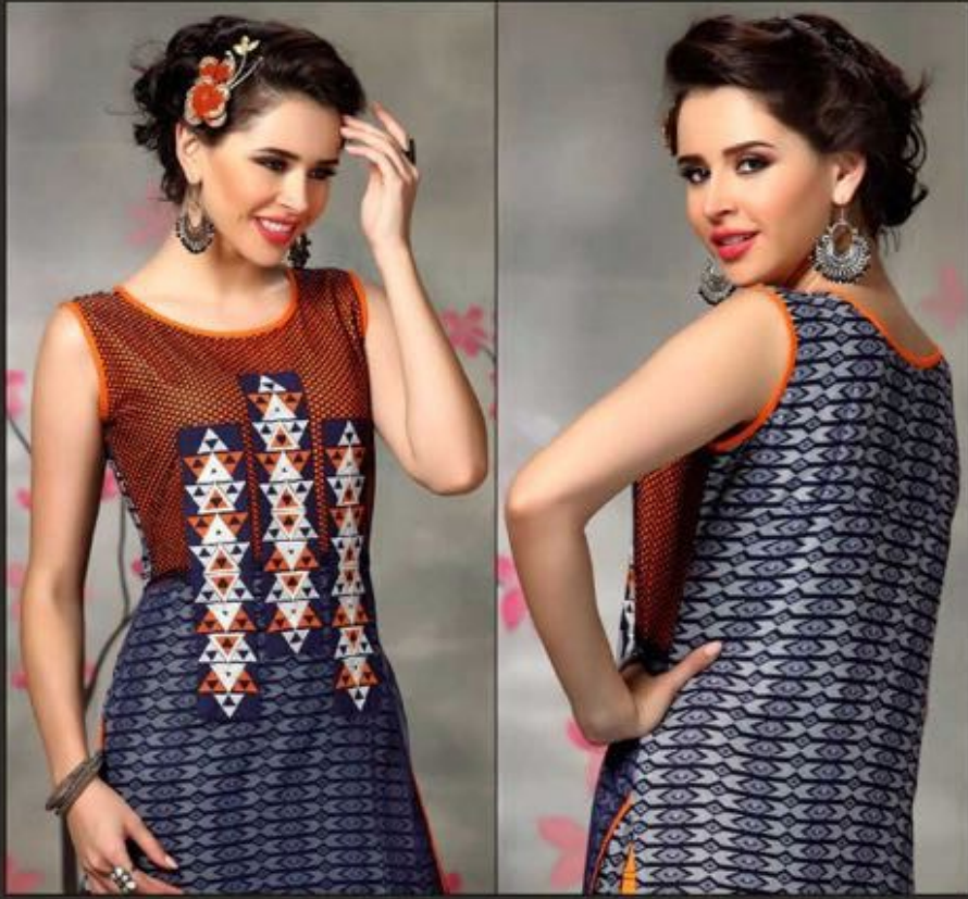
Beautiful blend of colors for the sensation of summer. Textile experts for the making A beautiful blend of all ages, making it with the affordability factor.