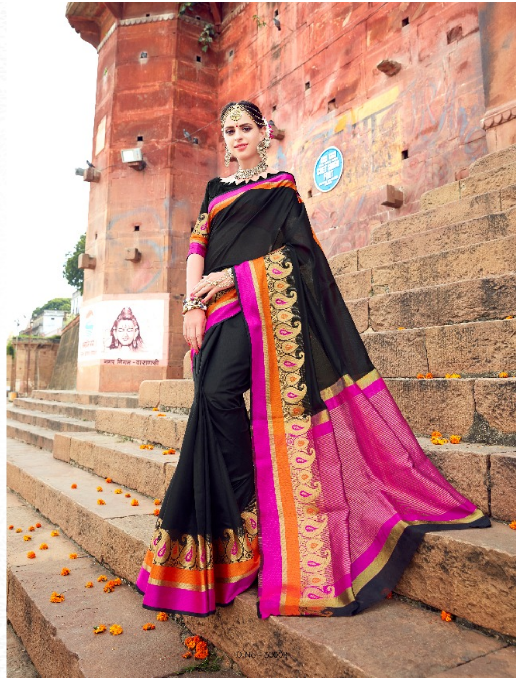
D.No - 53004