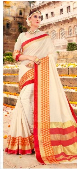
D No 2380