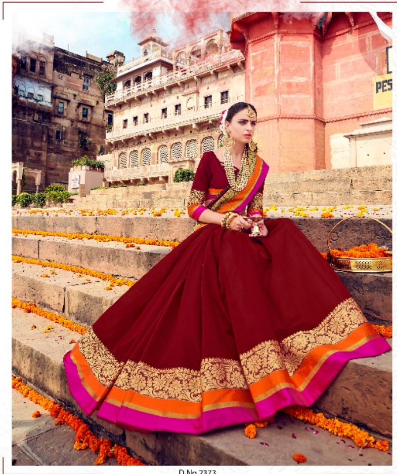
D No 2373