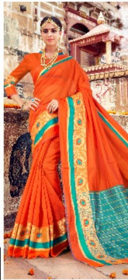
D No 2376