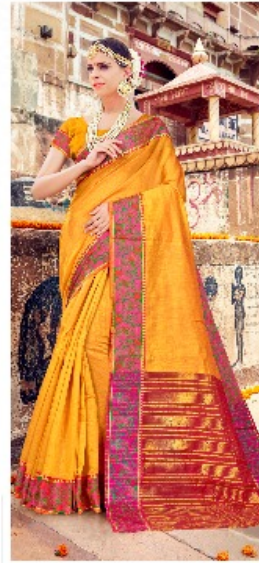
D No 2377