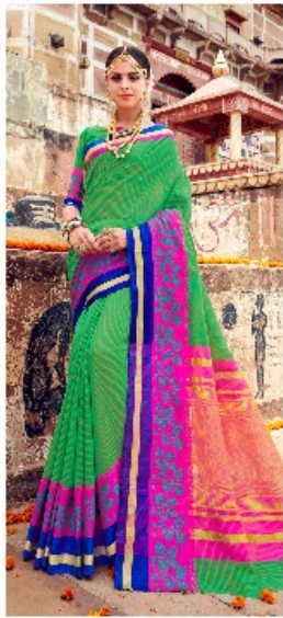
D No 2375