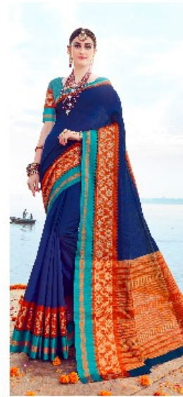
D No 2381