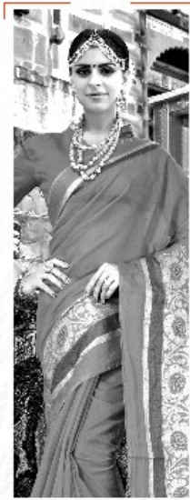
D No 2376

THE COMBINATION OF COLORS AND PRINT DESIGN ELEVATES YOUR STYLE THIS SEASON