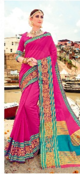
D No 2378