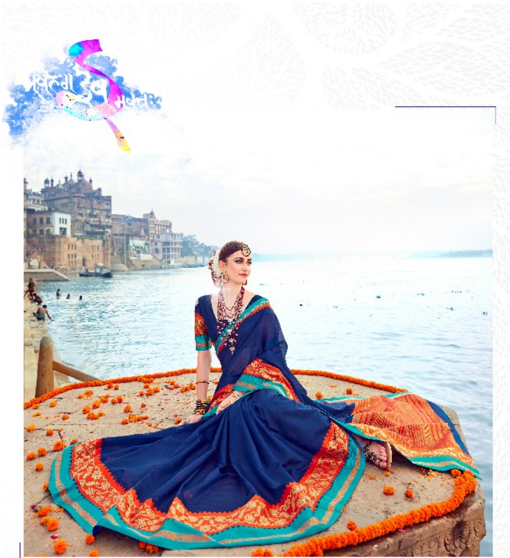
D No 2381

UNLIMITED TEMPTATION TO BRIGHTEN UP YOURLOOK WITH AN ARRAY OF FLORAL DESIGN THAT WILL TAKE YOU THROUGH THE SEASON IN STYLE.