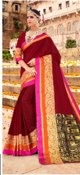
D No 2373