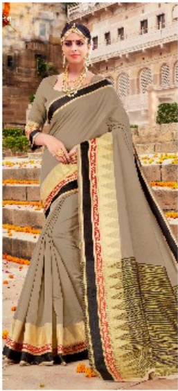
D No 2374