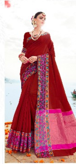
D No 2379