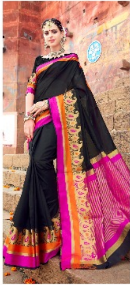
D No 2372