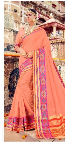
D No 2382