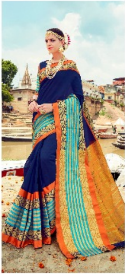
D No 2371