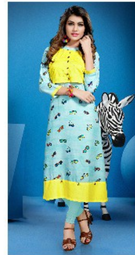
D.NO.: - 1001