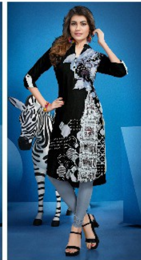
D.NO.: - 1003