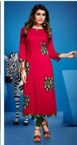
D.NO.: - 1002