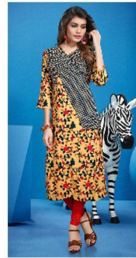
D.NO.: - 1004