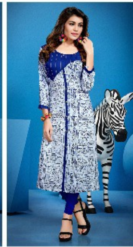
D.NO.: - 1006