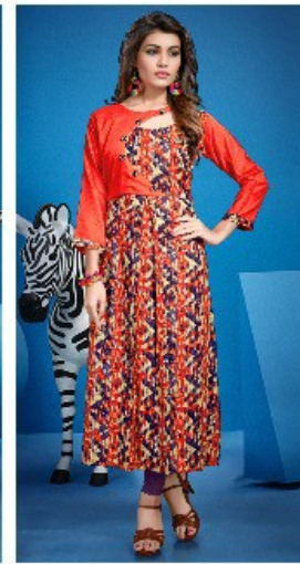
D.NO.: - 1005