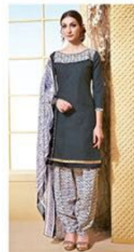
DESIGN NO. 2009