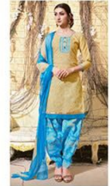
DESIGN NO. 2008