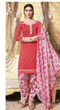
DESIGN NO. 2011