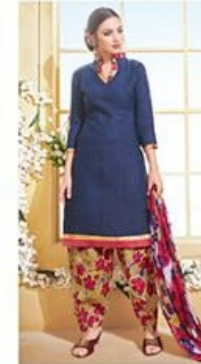
DESIGN NO. 2006