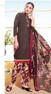
DESIGN NO. 2002