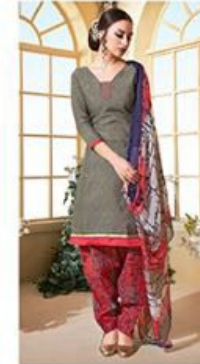
DESIGN NO. 2007