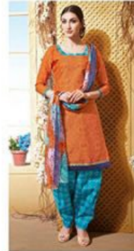
DESIGN NO. 2005