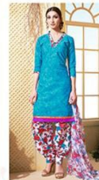
DESIGN NO. 2010