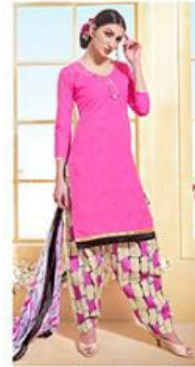
DESIGN NO. 2001