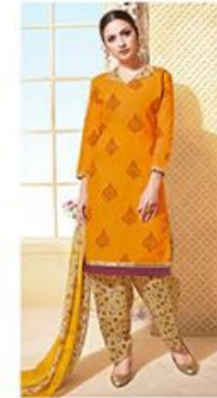
DESIGN NO. 2003