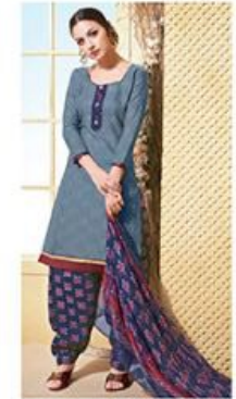
DESIGN NO. 2004