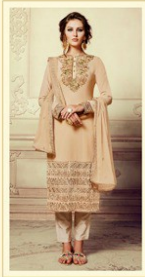
D No :- 101-A