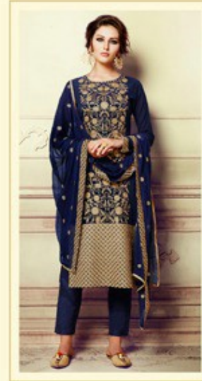
D No :- 103-A