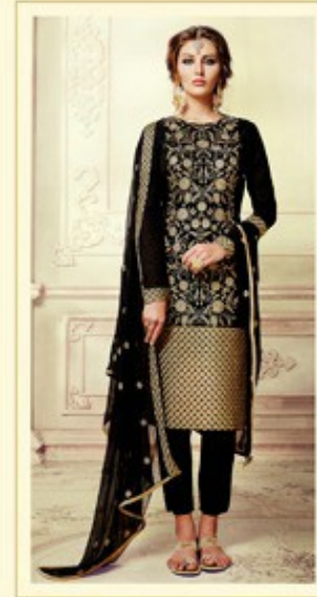
D No :- 103-B