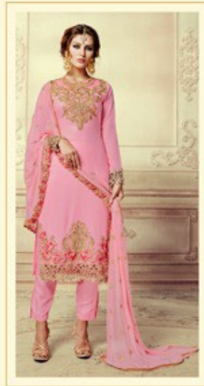
D No :- 102-B