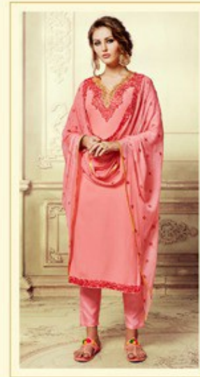
D No :- 104-B