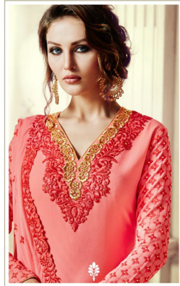
Straight suit dress with heavy sleeves embroidery. Suit in Peach Georgette with bottom in matching Santoon and dupatta in matching Chiffon.