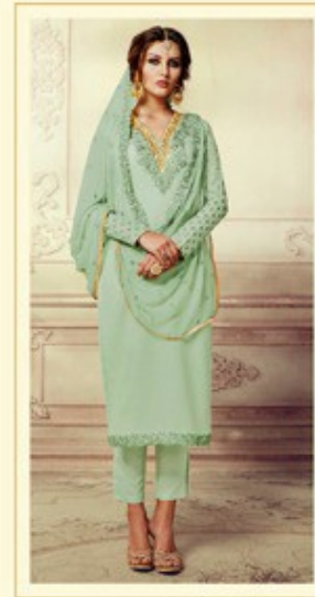
D No :- 104-A