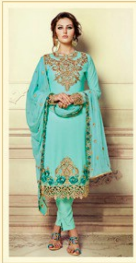
D No :- 102-A