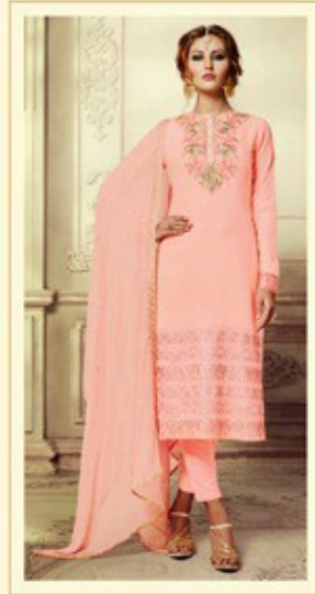
D No :- 101-B