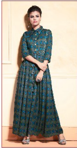
• 479 •