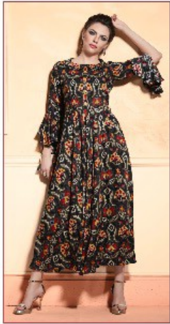
• 478 •