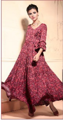
• 472 •