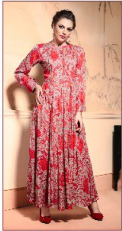
• 477 •