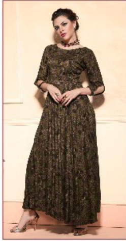
• 473 •