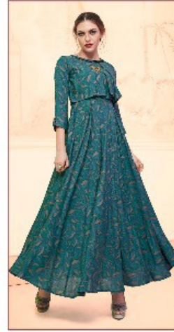
• 474 •