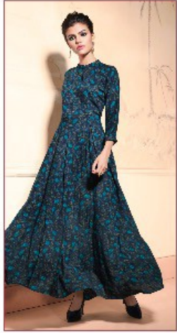
• 471 •