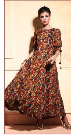
• 475 •