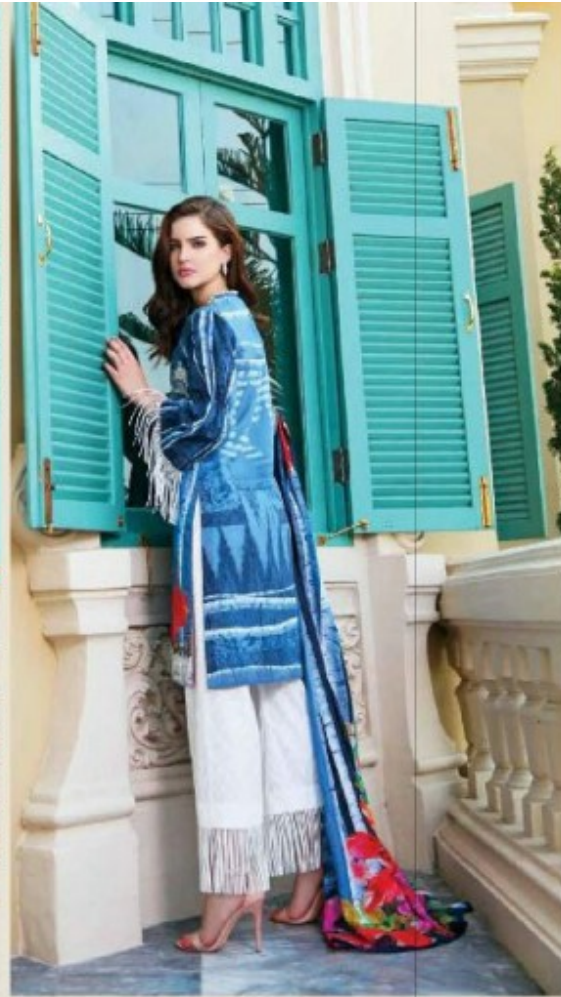
13 Embroidered Pina Lawn Suit with Printed Net Dupatta