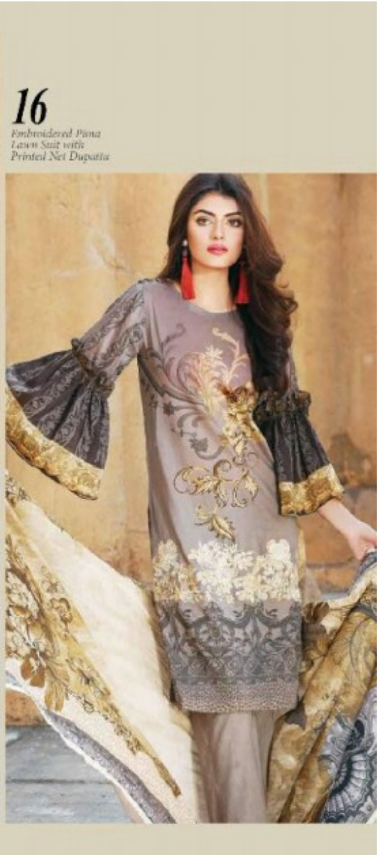
16 Embroidered Pina Lawn Suit with Printed Net Dupatta