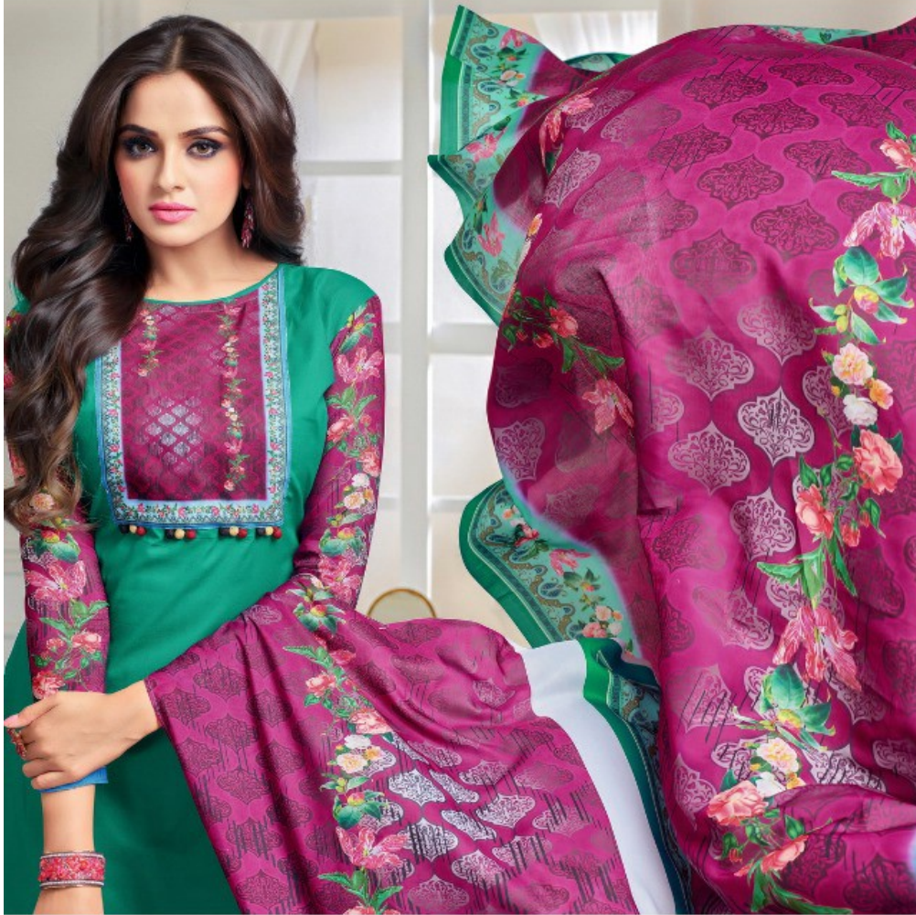
Comfort and simplicity are two keys to follow when it comes to fashion.