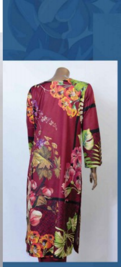
S E R E N A D E

Depicting a true essence of spirts of dawn, the tunic is immersed in the grace of flowing floral bunches covering the front as beautiful printed motifs. Pair it up with dark shaded trousers to lift its appeal up.