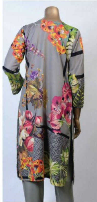
S E R E N A D E