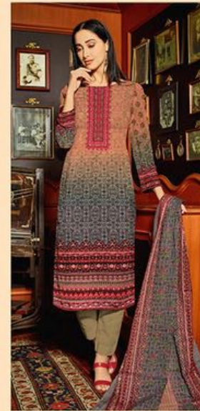
- 1010 -