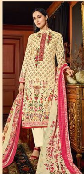
- 1005 -