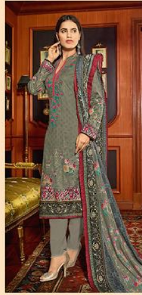
- 1006 -