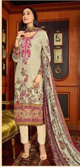
- 1003 -