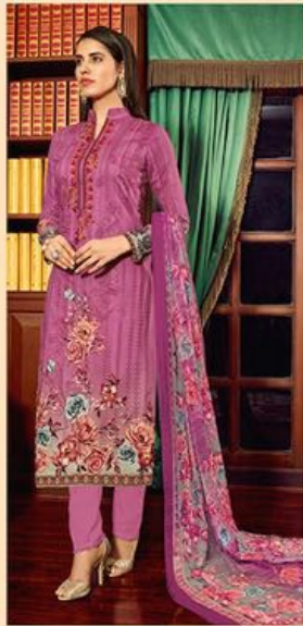
- 1004 -