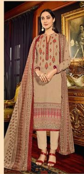
- 1009 -