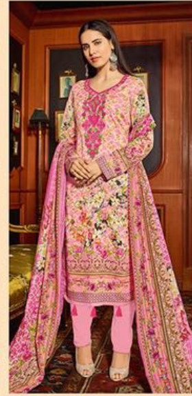
- 1007 -