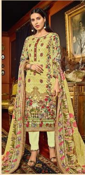
- 1002 -