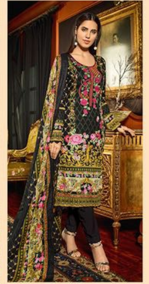
- 1008 -