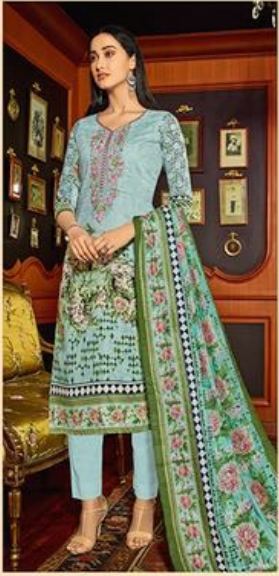
- 1001 -