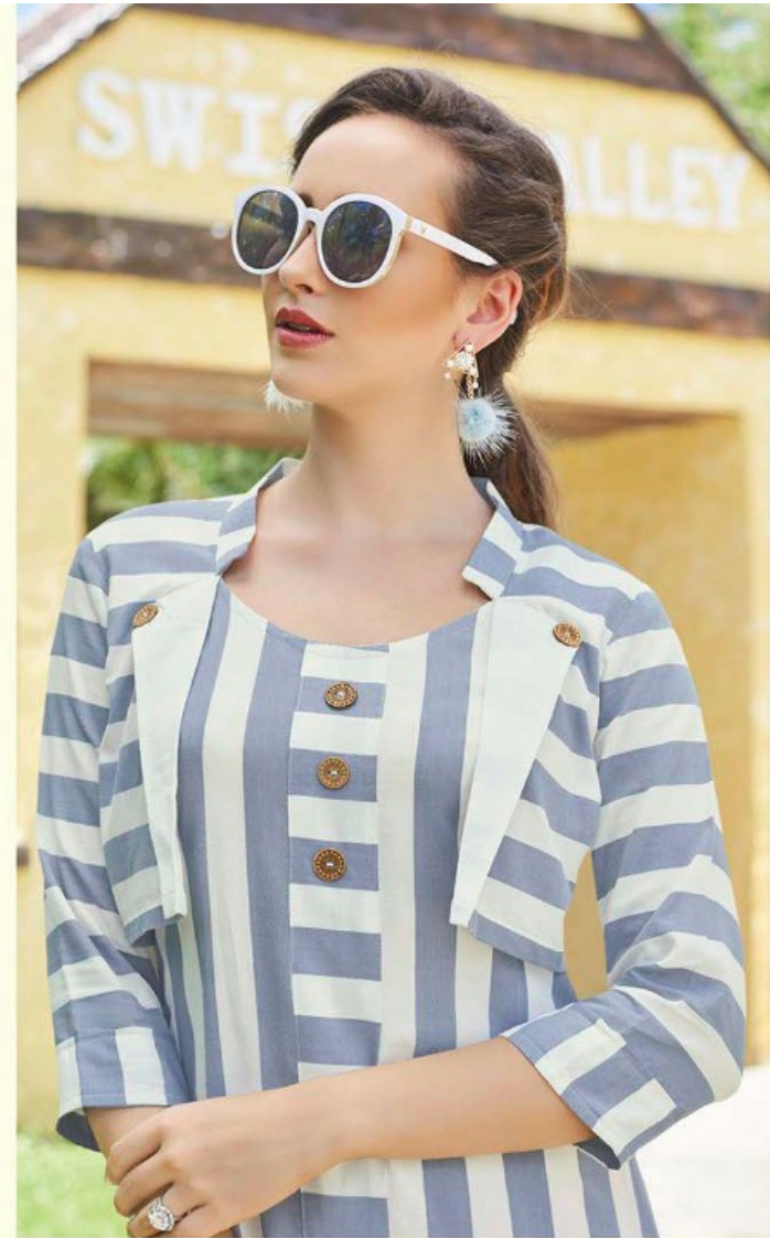
Explore the mystic beauty of stripes in summer season shades. [4507]