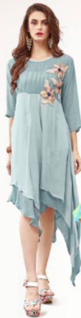
GARMENT CODE # 105