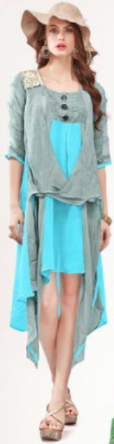
GARMENT CODE # 100