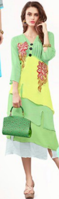
GARMENT CODE # 101