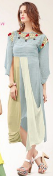
GARMENT CODE # 109