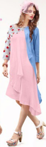
GARMENT CODE # 104