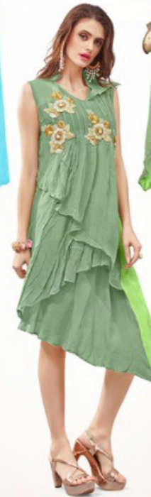
GARMENT CODE # 107