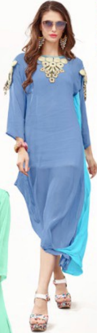
GARMENT CODE # 103