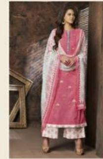
Z - 1B