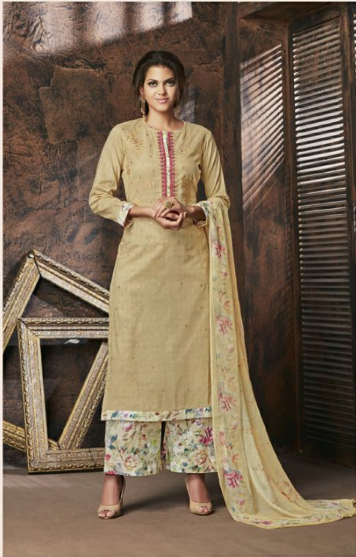
Z - 2B