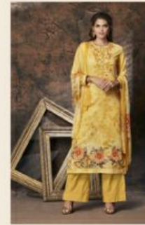
Z - 6D