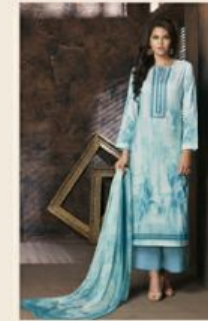
Z - 4D