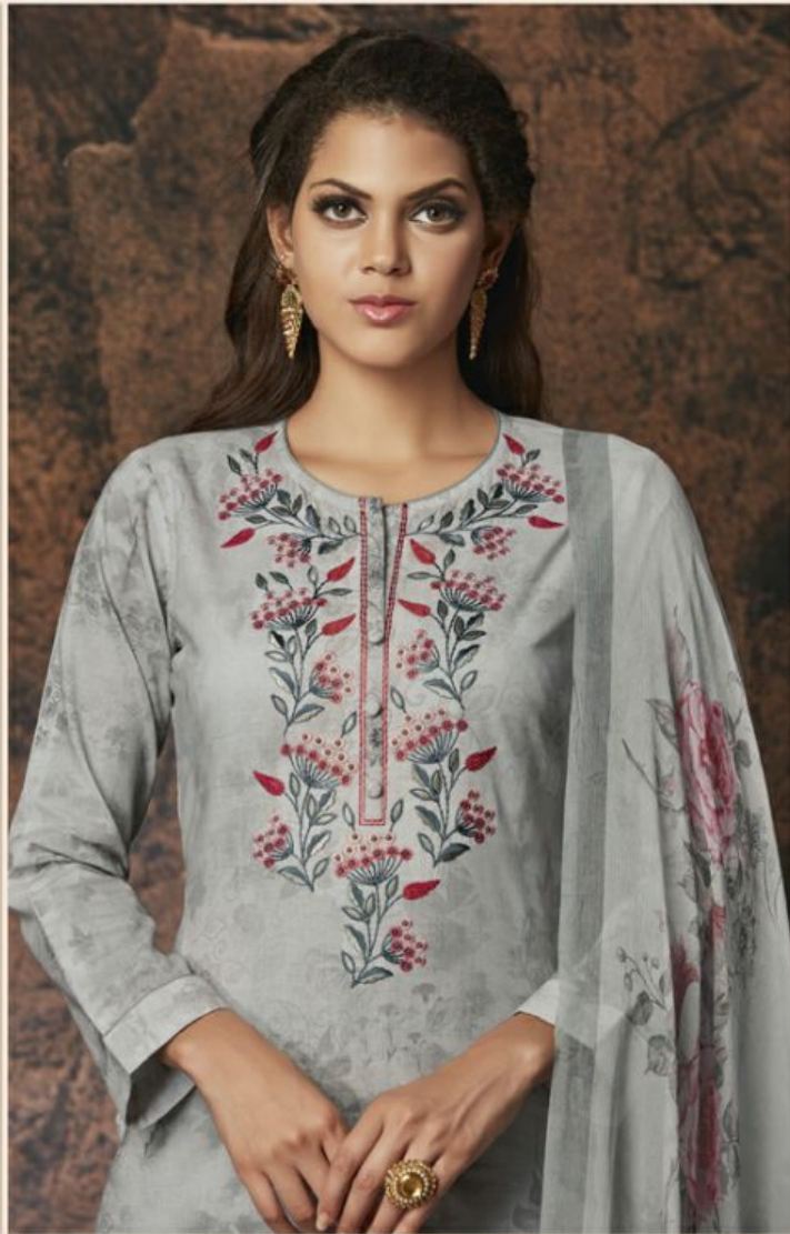
DISCOVER DESIGN WITH THE NEW SEASON COLLECTION AT WINDOW, INSPIRED BY THE COLORFUL STORIES OF INDIAN ASTROLOGICAL BELIEFS.