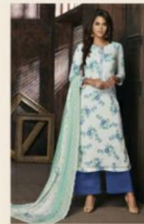
H - 3B