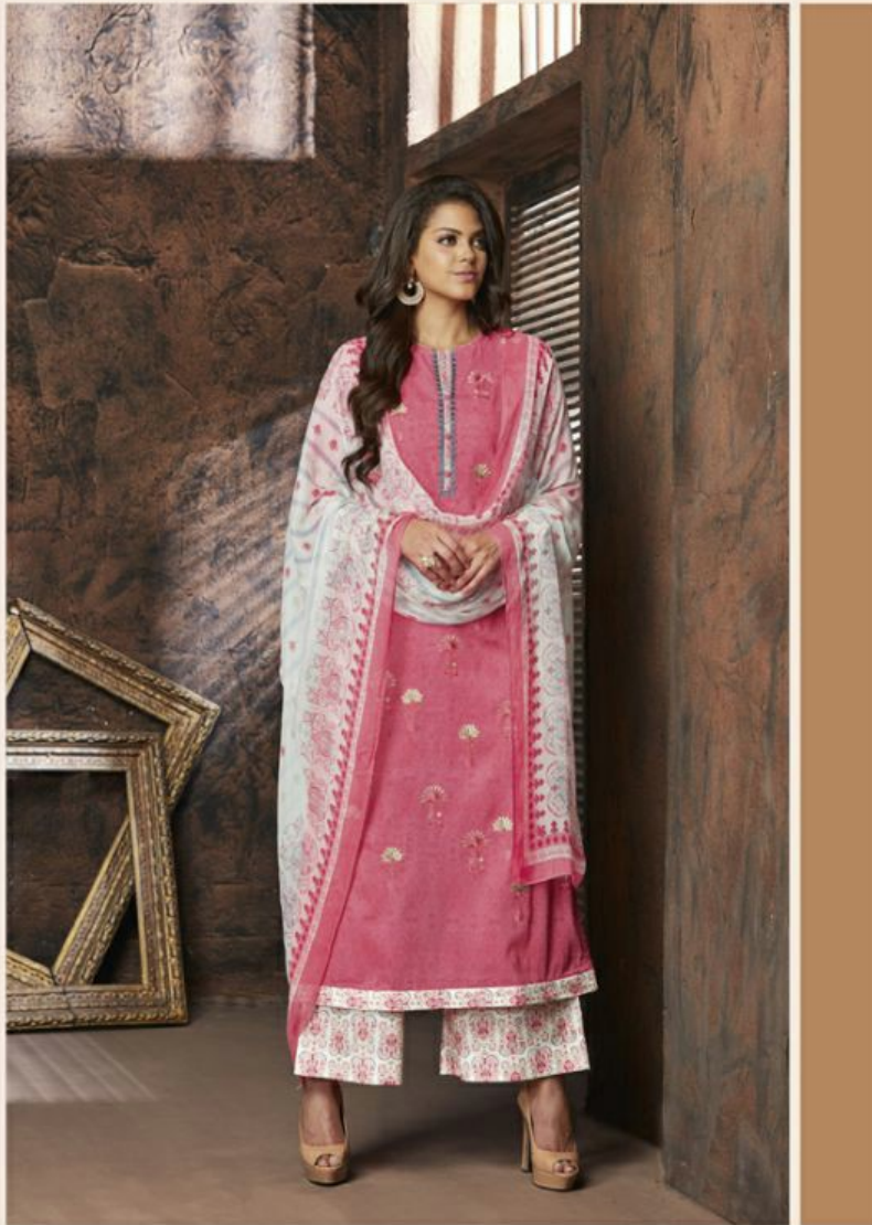
Z - 1B