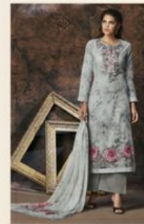
Z - 6C