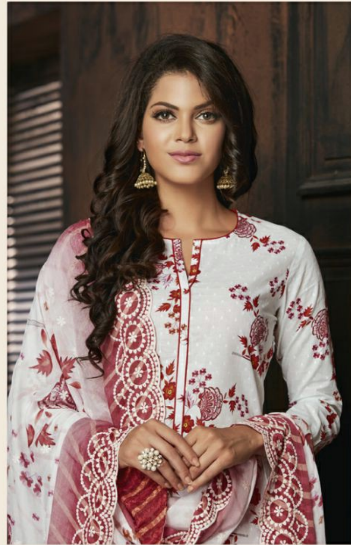
H - 3A

DISCOVER LATEST WITH THE NEW SEASON COLLECTION AT WIMBORN - INSPIRED BY THE GEOGRAPHICAL ELEMENTS OF INDIAN ARTISANAL CRAFTSMAN.