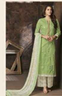
Z - 1A