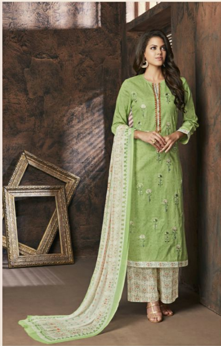
Z - 1A