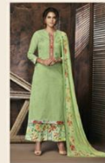
Z - 2C