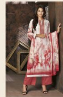
Z - 4C