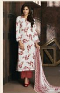
H - 3A