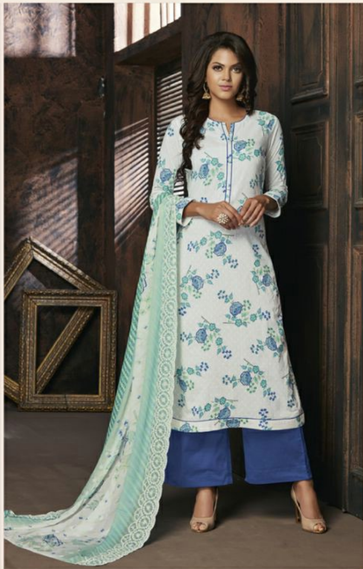
H - 3B