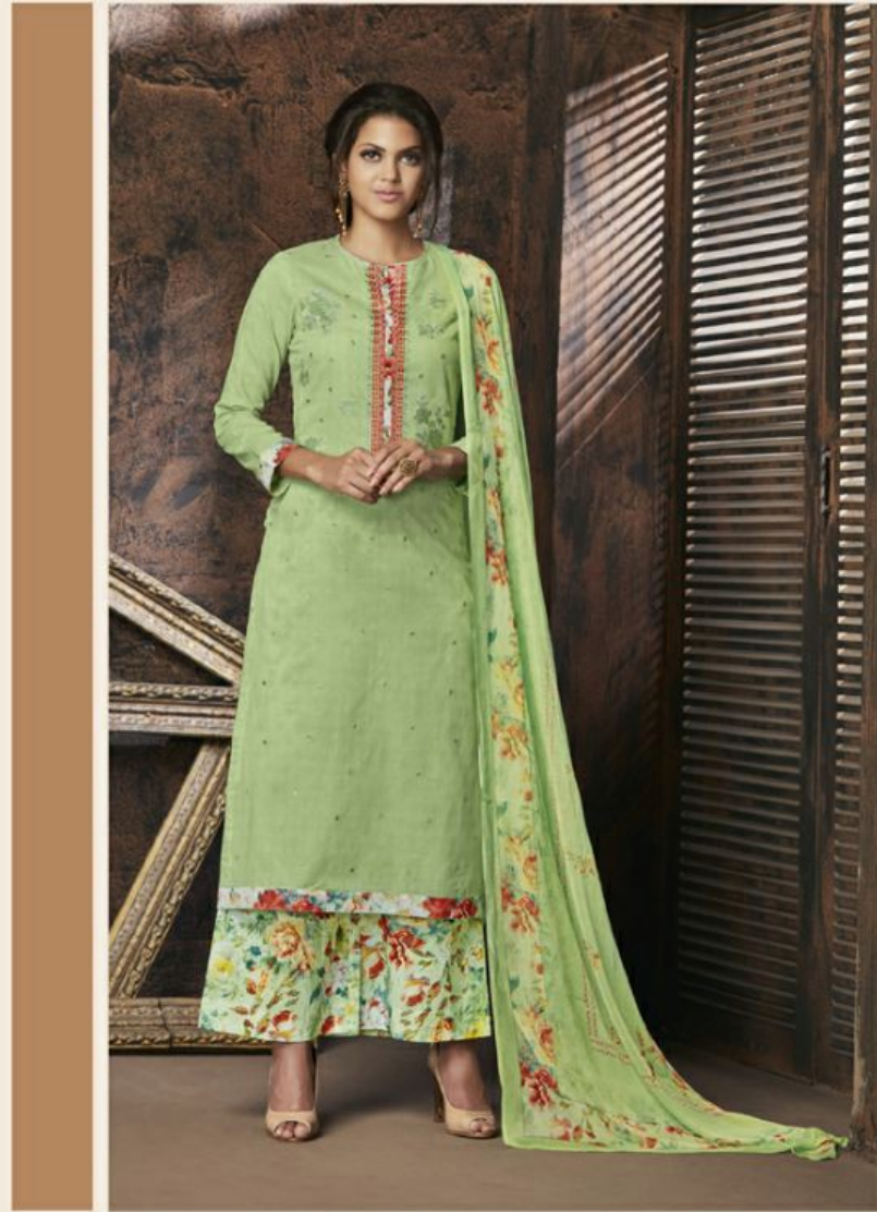
STUDIO'S DESIGN WITH THE NEW SEASON COLLECTION AT WINDOW, INSPIRED BY THE COLORFUL STORIES OF INDIAN ASTROLOGICAL BELIEFS.