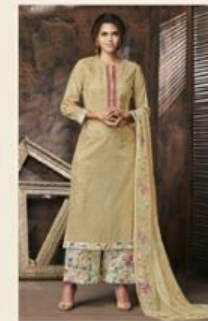
Z - 2B