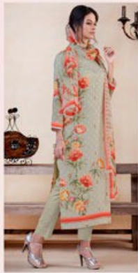
☼ ☼ ☼ STYLE.NO.5804