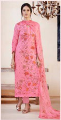
☼ ☼ ☼ STYLE.NO.5801