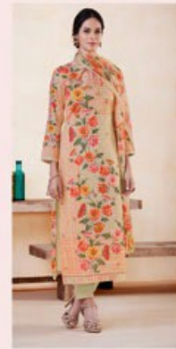
☼ ☼ ☼ STYLE.NO.5806