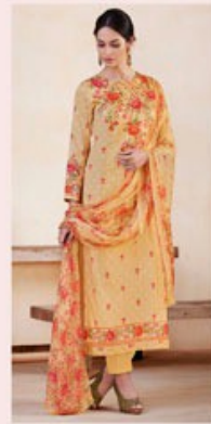
☼ ☼ ☼ STYLE.NO.5805