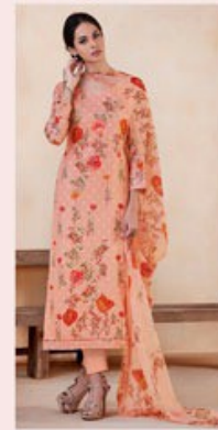
☼ ☼ ☼ STYLE.NO.5807