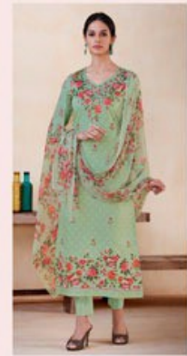
☼ ☼ ☼ STYLE.NO.5808