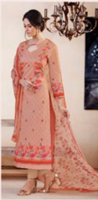
☼ ☼ ☼ STYLE.NO.5802