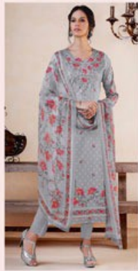
☼ ☼ ☼ STYLE.NO.5803