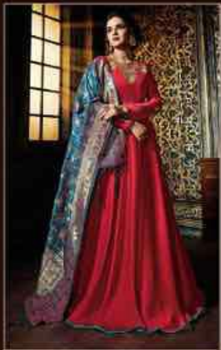
D. NO.: 9085