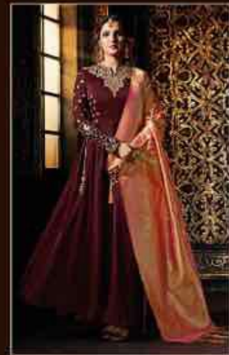
D. NO.: 9088