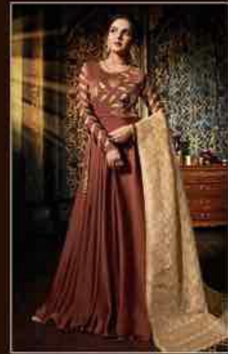
D. NO.: 9084