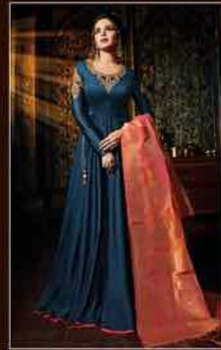
D. NO.: 9083