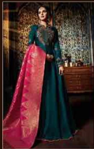
D. NO.: 9086