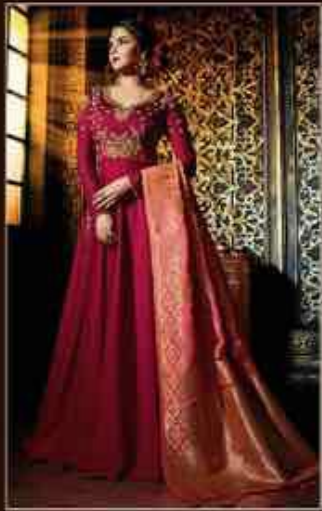
D. NO.: 9081