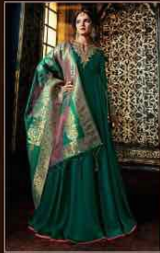
D. NO.: 9082