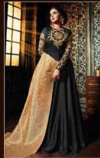
D. NO.: 9087