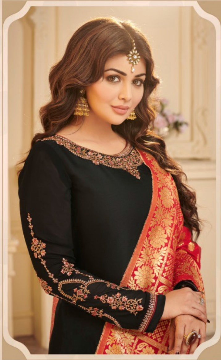
"A VERY FESTIVE MERGE"