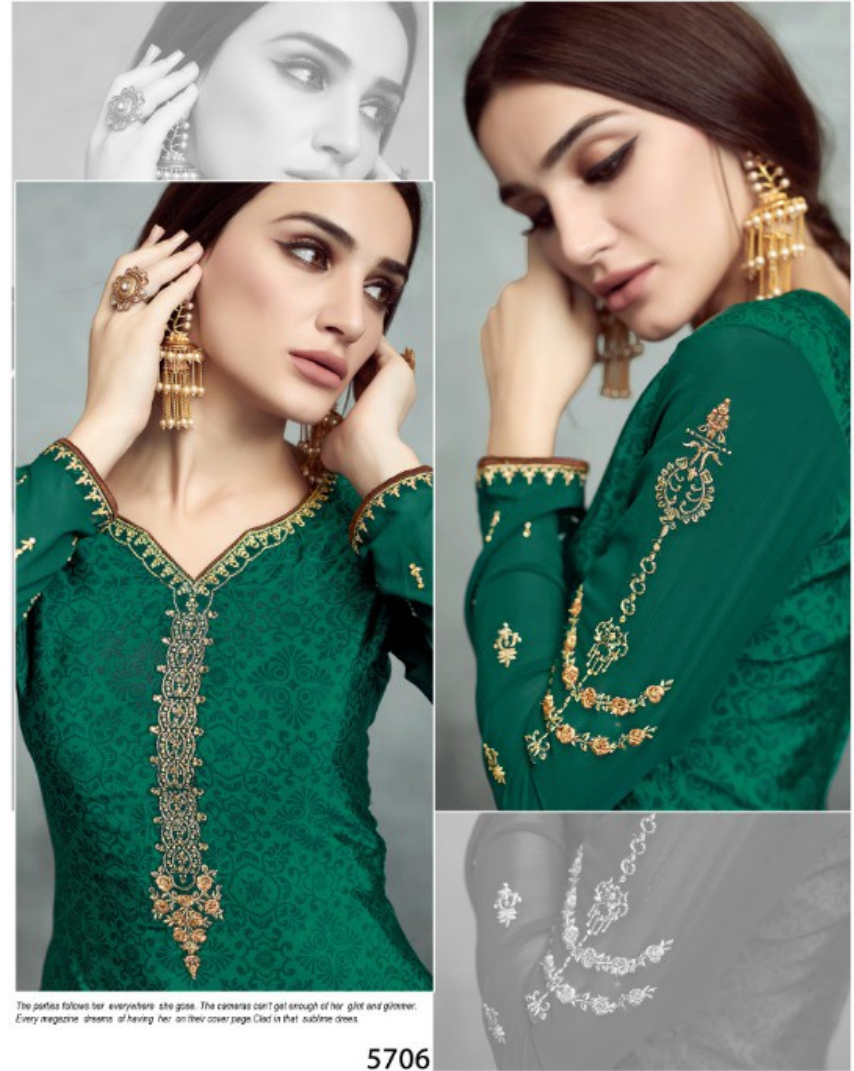
The parties follows her everywhere she goes. The cameras can't get enough of her glint and glitter. Every magazine dreams of having her on their cover page. Clad in that outline dress.