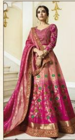
D. NO. : 13167