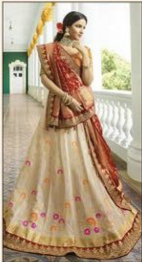
D. NO. : 13164