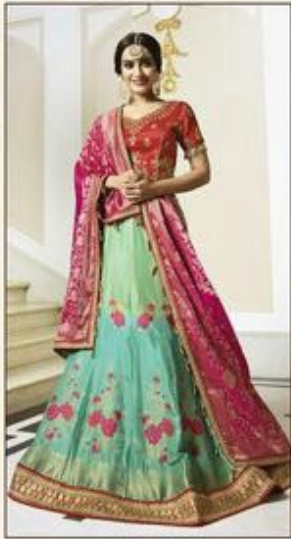
D. NO. : 13161