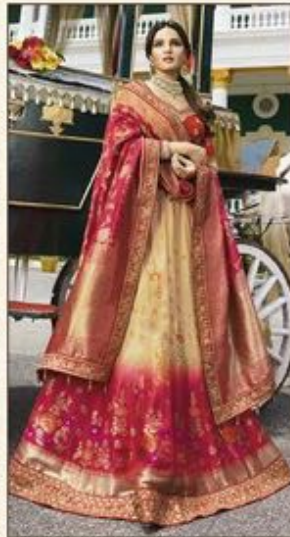
D. NO. : 13166