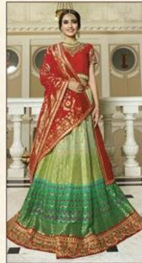
D. NO. : 13170