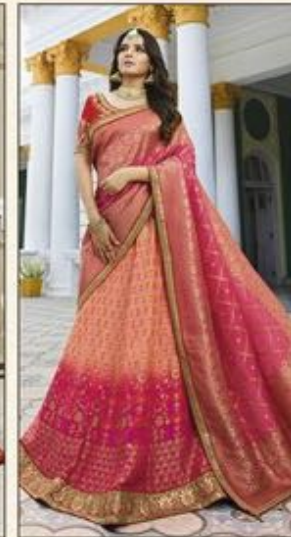
D. NO. : 13171