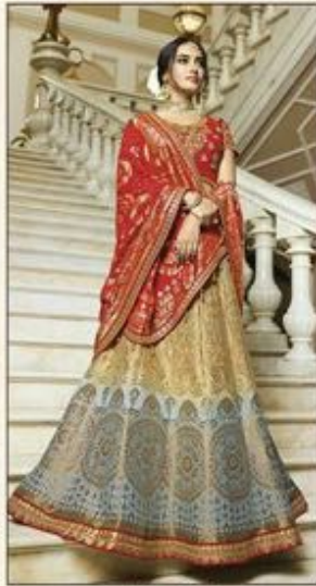
D. NO. : 13162