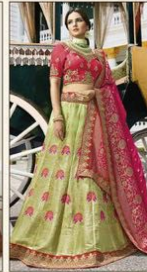
D. NO. : 13168