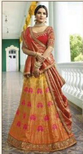
D. NO. : 13165