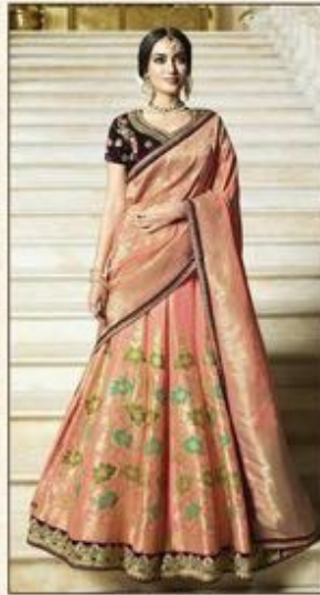
D. NO. : 13163