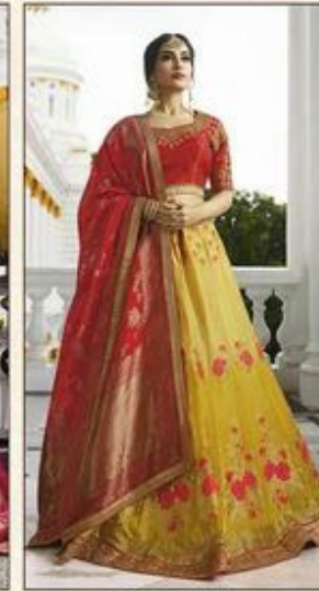
D. NO. : 13169