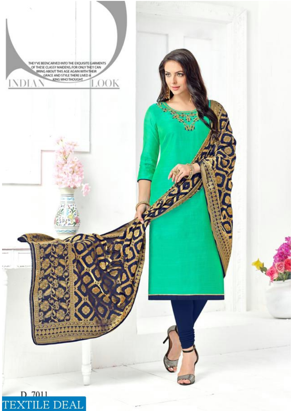
D. 7011 TEXTILE DEAL

THEY'VE BEEN CARVED INTO THE EXQUISITE GARMENTS OF THESE CLASSY MAIDENS, FOR ONLY THEY CAN BRING ABOUT THIS AGE AGAIN WITH THEIR GRACE AND STYLE THERE LIVED A KING WHO THOUGHT INDIAN LOOK