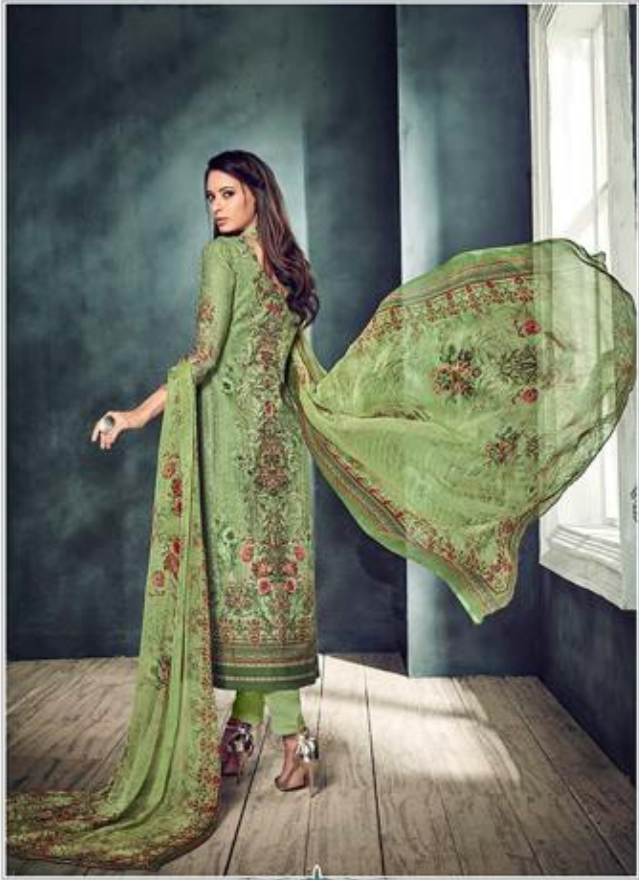
This collection bring you an unmatched luxury in brilliant tone with a wide range of embroidered fabrics D.NO:- 697