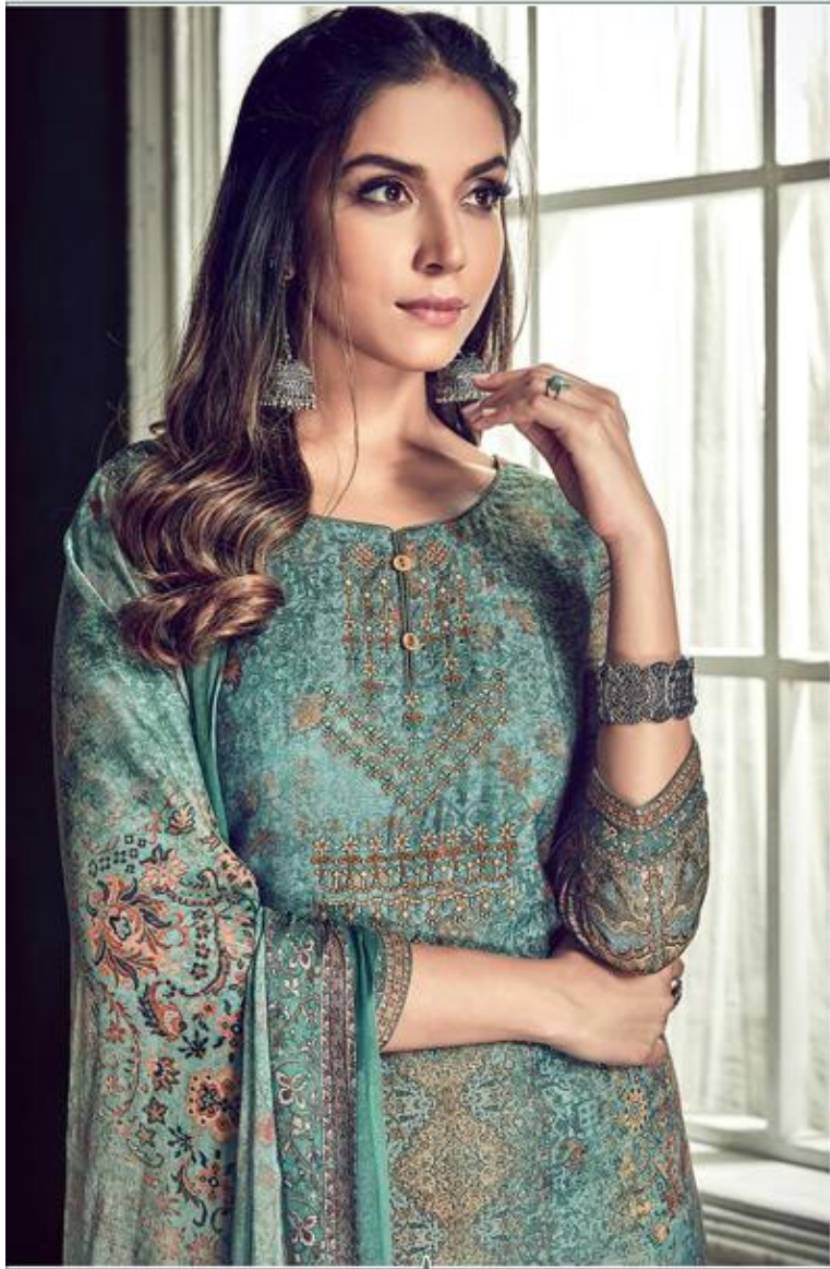
Extremely beautiful fashion piece of ethnic wear designed keeping grandeur in mind...