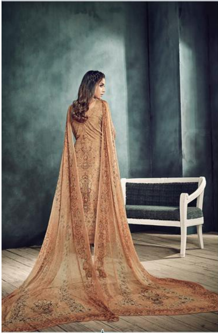
Let your dress complement your trend and personality... D.NO- 700