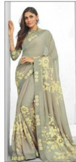
D. NO. - 1208