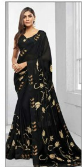
D. NO. - 1212