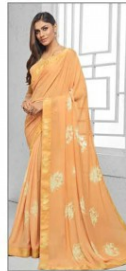
D. NO. - 1211