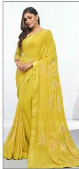
D. NO. - 1203