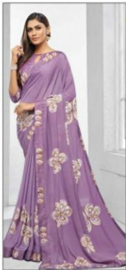
D. NO. - 1204