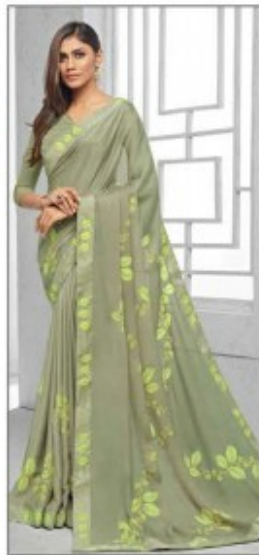
D. NO. - 1205