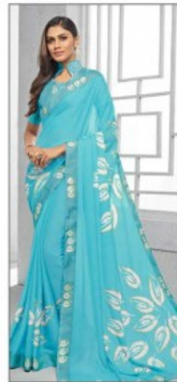
D. NO. - 1210