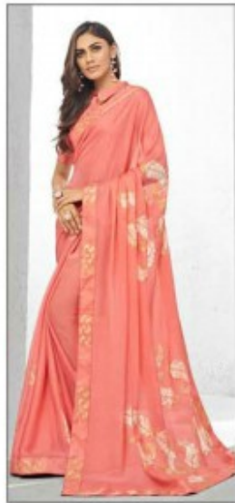
D. NO. - 1202