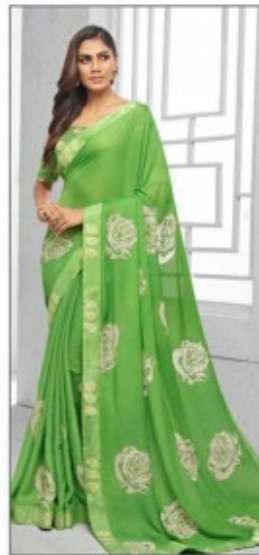
D. NO. - 1206