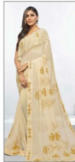
D. NO. - 1207