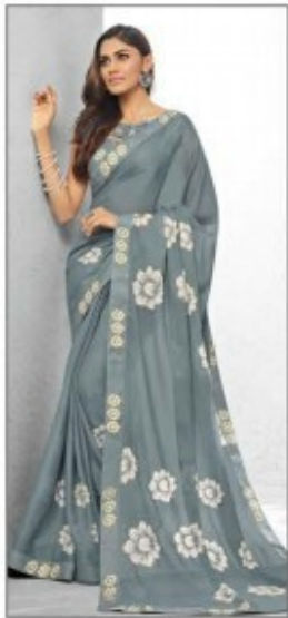
D. NO. - 1201