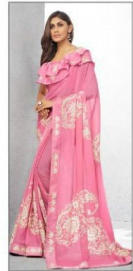
D. NO. - 1209