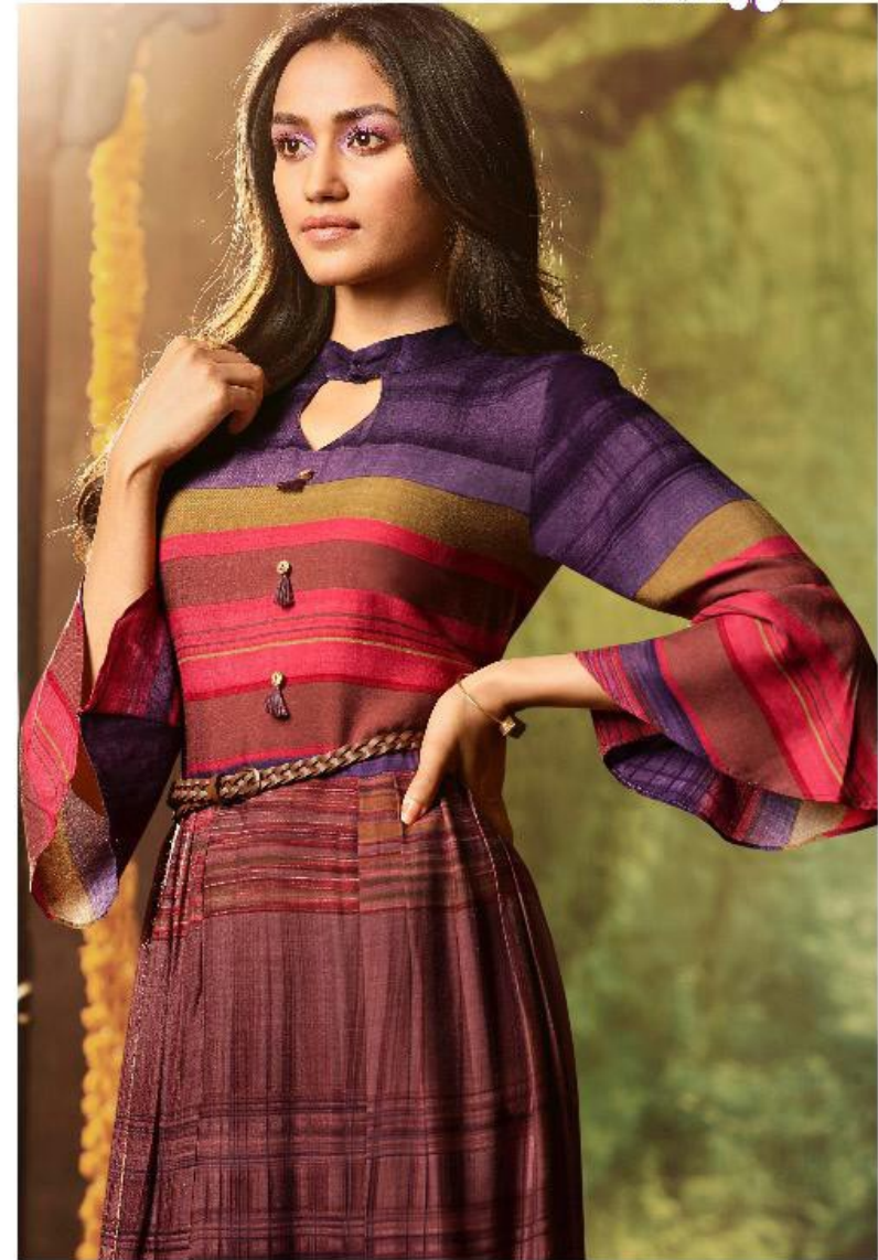
Being trendy is being stylish but being elegant. Women of this age don't only look for fashion but they are also concerned about comfortable styling. This garment gives them the best of both worlds with a leather belt perfectly match both sense of styling and contemporary look. One colour palette is always better, giving that effect of some subtle casual femininity.