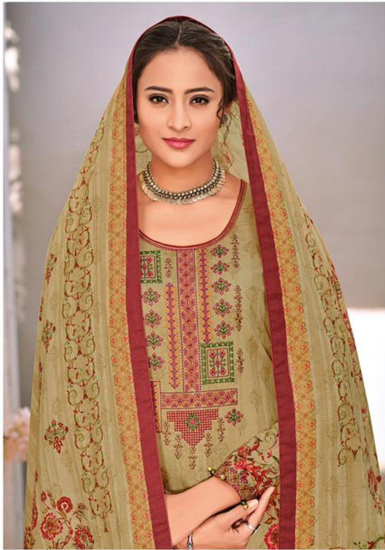
NAITRA | 104