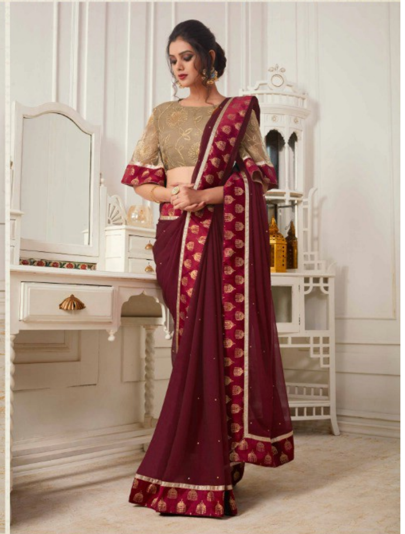
Blended & contrasted the colors cleverly with her skillful touches & presented creations that had distinct eye catching appeal. The key is to contrast two elements so you don't end up over doing the feminine quotient.