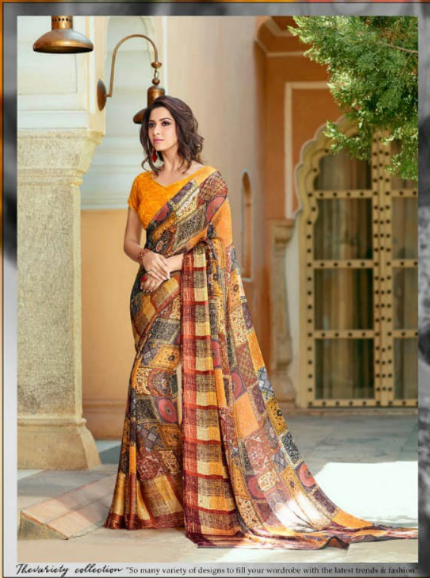
The variety collection "So many variety of designs to fill your wardrobe with the latest trends & fashion"