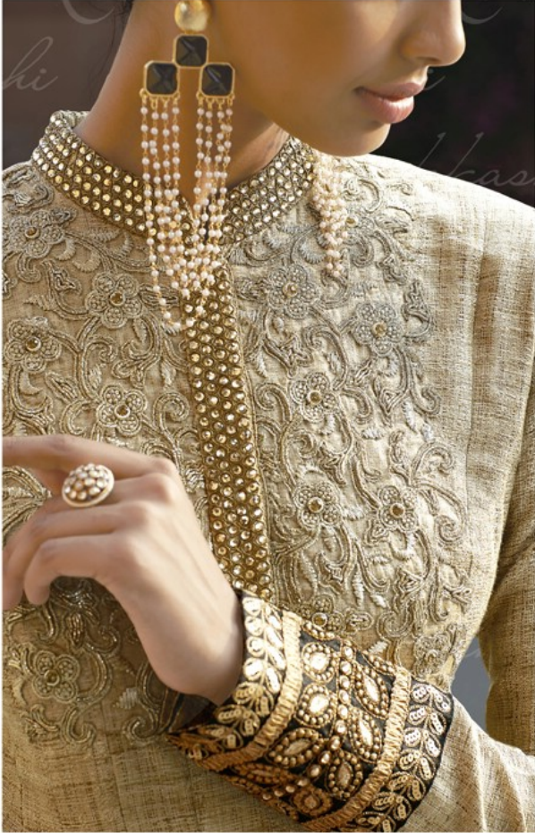
THIS BEIGE KHADI TOP WITH IMMACULATELY ETHNIC EMBROIDERY WORK AT FRONT YOKE IN CHINESE COLLAR AND PLACKET EMBELLISHED WITH STONES WORK GIVES A STAGGERING LOOK. ADD-ON LACE WORK IN SLEEVES & TOP'S BOTTOM IN BLACK JACQUARD. BEIGE NET DUPPATA EFFECTUATE THE WHOLE GLANCE.