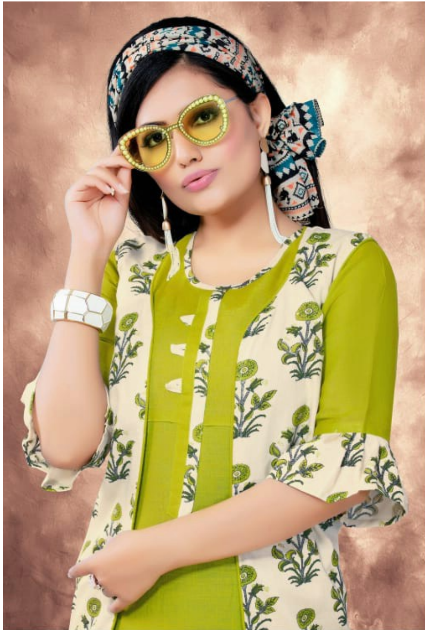
this collection bring you an unmatched luxury in brilliant tones with a wide range of designer style